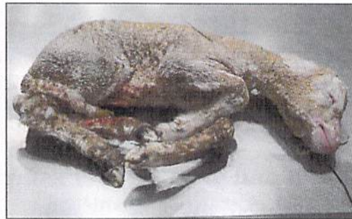
Left: Aborted ovine fetus.