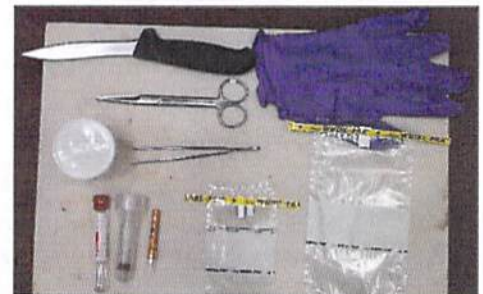
Sampling equipment.