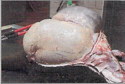
Left: Heifer that died from bloat (photo credit: CAHFS lab).