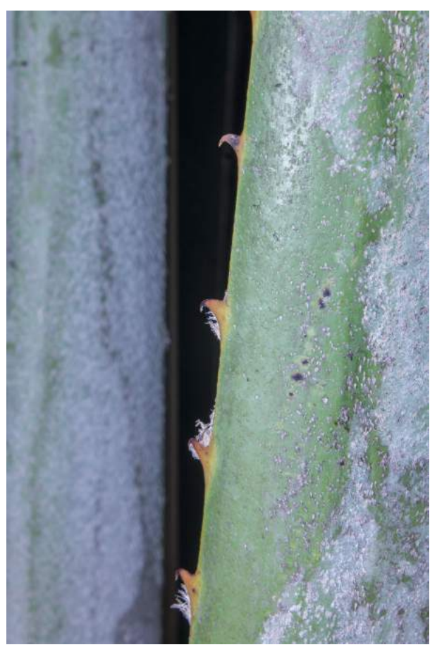
Figure 4. Petiole margins of Copernicia fallaensis are coarsely but sharply toothed. Near the type locality in Ranchuelo, Falla, Ciego de Ávila, Cuba.

This description is based on Dahlgren and Glassman (1963), León (1931), Verdecia (2016), and our observations in the field. Copernicia fallaensis , the giant of the genus, grows to 20 m tall, has a trunk 80 cm in diameter, leaves nearly four m long, and a canopy that can spread for more than eight m across ( Fig. 2 ). The trunk is straight and uniform, sometimes slightly spindle-shaped or narrowed proximally, the latter perhaps induced by overharvesting of leaves and/or fire at a young age. Faint leaf scars mark the otherwise smooth, whitish surface.