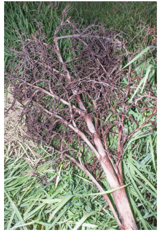
Figure 10. Inflorescences of Copernicia fallaensis typically have 10 or more first-order branches, the most proximal ones originating from near the base. Near the type locality in Ranchuelo, Falla, Ciego de Ávila, Cuba (D. R. Hodel).

However, because of a long history of overzealous leaf harvesting, primarily for roof thatching, and land clearing for agriculture, Copernicia fallaensis is currently restricted and highly fragmented. For example, only one adult remains at La Esperanza in Villa Clara. Now the best, largest, and healthiest population is near or at the type locality at Ranchuelo near Falla in Ciego de Ávila where 84 adult trees and 187 juveniles exist in a highly disturbed, secondary forest with a few scattered plants nearby in savanna and cleared pasture (Verdecia 2016) ( Figs. 12-13 ). Fortunately, co-authors Duanny and Milián