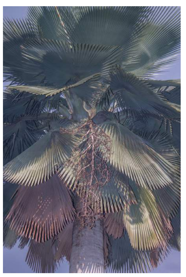
Figure 8. Inflorescences of Copernicia fallaensis emerge erect but eventually droop on to subtending leaves. Near the type locality in Ranchuelo, Falla, Ciego de Ávila, Cuba (D. R. Hodel).

2016). Like other Copernicia , bats consume fruits and disperse the seeds of C. fallaensis , and germination is rapid, within one month (Verdecia 2016), probably to take advantage of the moist substrate before the onset of the fast-approaching and lengthy dry season.