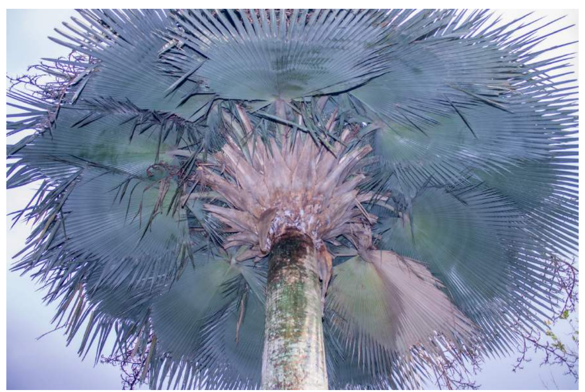
Figure 14. Because of their large size and durability, leaves of Copernicia fallaensis are much prized and are harvested for a variety of products. Note the remnant petioles and leaf bases from which leaves were harvested. Near the type locality in Ranchuelo, Falla, Ciego de Ávila, Cuba (D. R. Hodel).