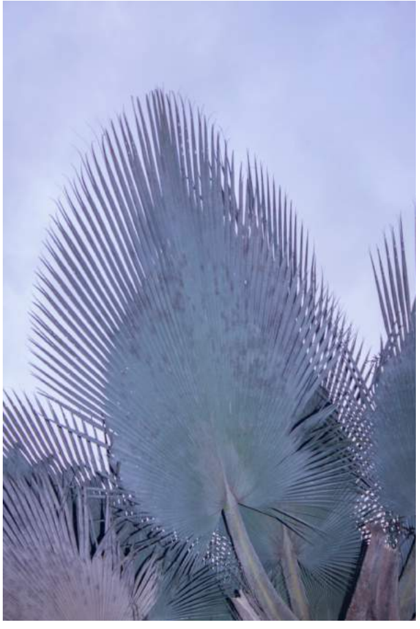
Figure 6. Leaf blades of Copernicia fallaensis are divided about one-third to the base into about 120, stiff segments. Near the type locality in Ranchuelo, Falla, Ciego de Ávila, Cuba (D. R. Hodel).

The whitish, likely insect-pollinated flowers are 4.5 mm long and solitary but so densely placed, up to 25 per one cm, that they might appear to be clustered. The ovate, proximally narrowed fruits are 23 mm long and 19 mm wide and mature yellow-green. Flowering occurs in May and June, at the onset of the first rainy period, and fruits develop over four months, maturing in late September and October at the onset of the second rainy period (León 1931, Verdecia