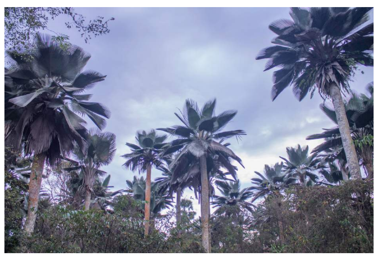
Figure 12. The best, largest, and healthiest population of Copernicia fallaensis is near or at the type locality at Ranchuelo near Falla in Ciego de Ávila.