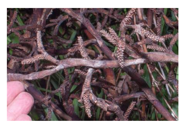
Figure 11. Flower-bearing rachillae of Copernicia fallaensis are to five cm long, four mm in diameter, stiff, and with close-set flowers. Near the type locality in Ranchuelo, Falla, Ciego de Ávila, Cuba (D. R. Hodel).

Fortunately, co-author Raúl Verdecia and the Las Tunas Botanic Garden have been