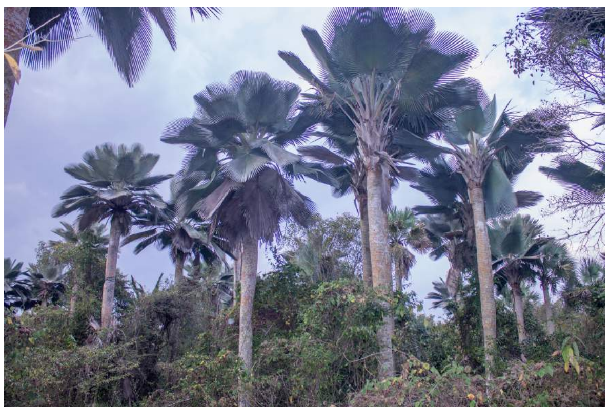
Figure 13. At this large population of Copernicia fallaensis 84 adult trees and 187 juveniles exist in a highly disturbed, secondary forest with a few scattered plants nearby in savanna and cleared pasture. Note that some individuals have had leaves harvested. Near or at the type locality in Ranchuelo, Falla, Ciego de Ávila, Cuba.