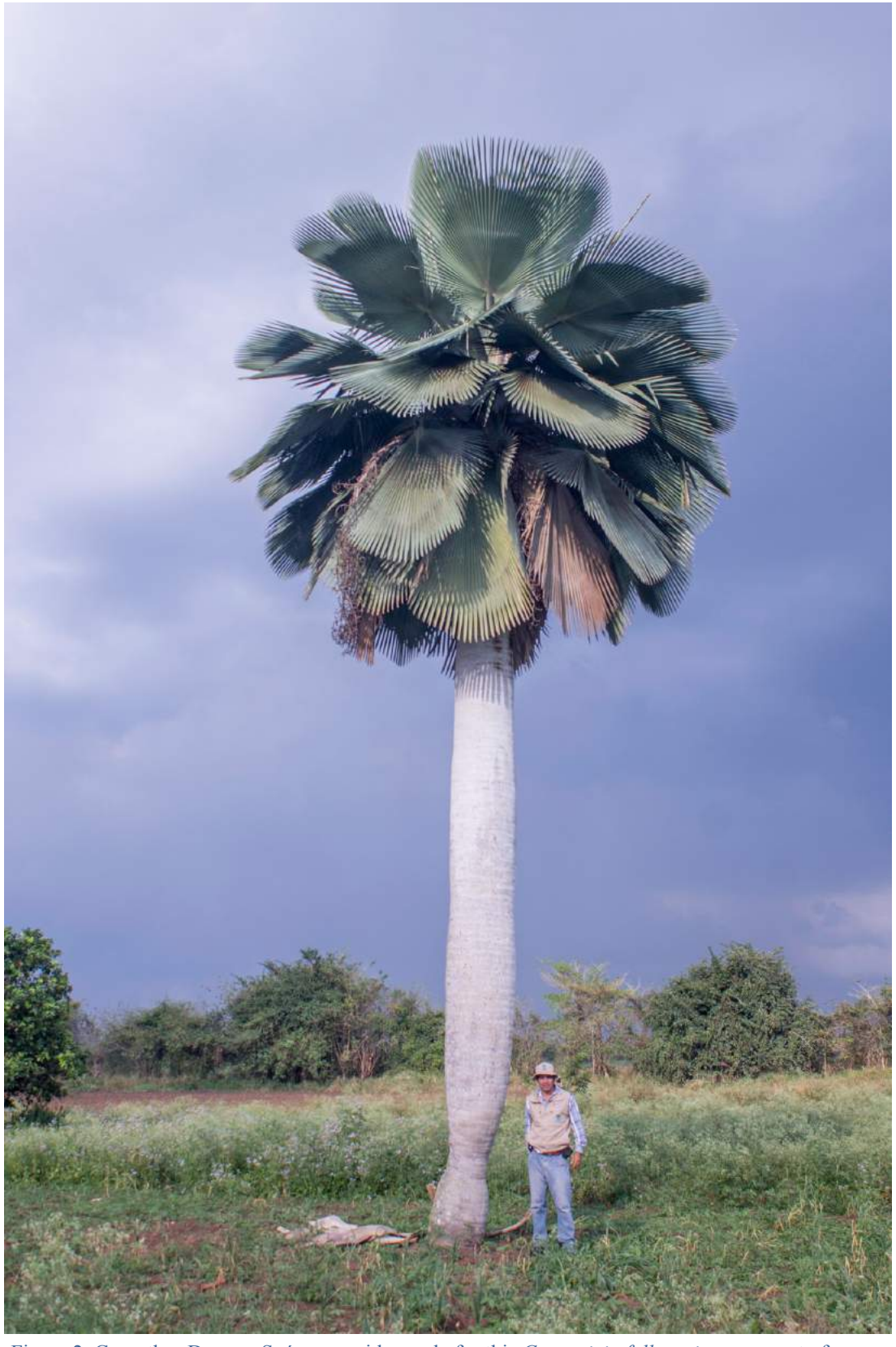
Figure 2. Co-author Duanny Suárez provides scale for this Copernicia fallaensis , a remnant of a once more extensive grove near the type locality in Ranchuelo, Falla, Ciego de Ávila, Cuba. This species typically has a large, straight trunk to 20 m tall topped with leaves nearly four m long and a canopy that can spread for more than eight m across (D. R. Hodel).