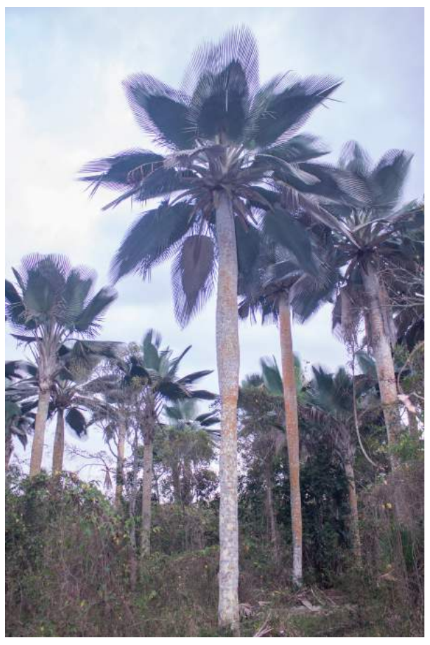
Figure 15. Even at the best population of Copernicia fallaensis some of the palms have evidence of leaf harvesting. Near or at the type locality in Ranchuelo, Falla, Ciego de Ávila, Cuba (D. R. Hodel).

perhaps it would be more appropriate to amend the title to "The Greatest Palm of Them All"