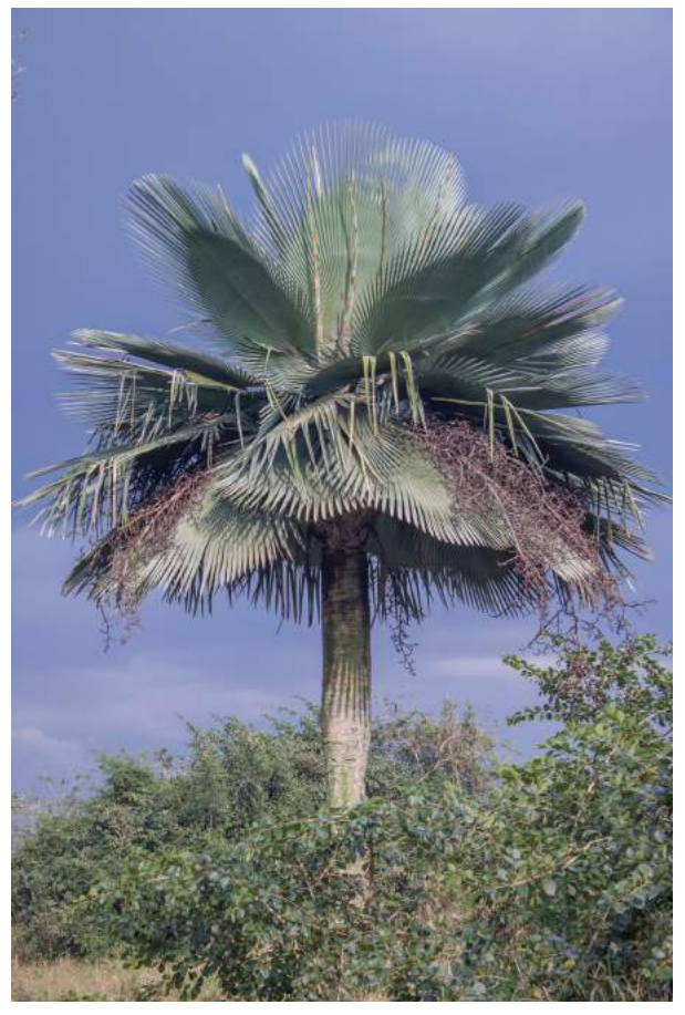
Figure 9. Inflorescences of Copernicia fallaensis are from 3.5 to 4 m long and about equal or slightly exceed the leaves in length. Near the type locality in Ranchuelo, Falla, Ciego de Ávila, Cuba.

Called "yarey" (the vernacular for all Copernicia in Cuba) or "yarey macho," which seems more descriptive and appropriate, C. fallaensis historically occurred in mesic, seasonally dry, semideciduous forest, savannas, and woodlands on heavy but fertile