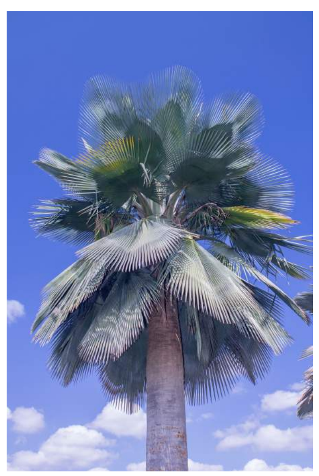
Figure 3. The canopy of Copernicia fallaensis typically holds 30 to 40, stiffly ascending to spreading to drooping, waxy grayish, stunning leaves. Jardín Botánico Nacional in Habana (D. R. Hodel).