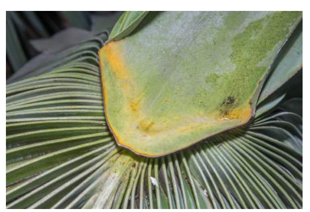
Figure 7. Adaxially the hastula of Copernicia fallaensis is nine cm long. Near the type locality in Ranchuelo, Falla, Ciego de Ávila, Cuba (D. R. Hodel).