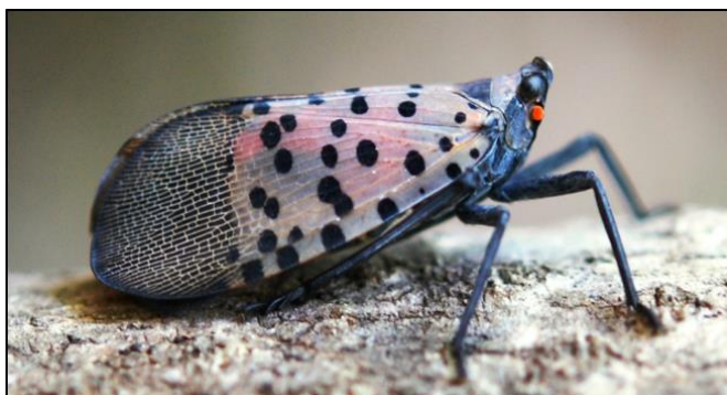
Figure 1. Side view of the adult Spotted Lanternfly (SLF).

Invasive species have the potential to cause high levels of economic damage when introduced into new environments that lack the predators that normally suppress their population in their native environments. International and national travel and commerce are ideal avenues for the introduction of exotic pests into the United States and California. Therefore, the identification and early detection of exotic pests are key to preventing their establishment in California. Everyone, including growers, PCA's, field workers, and home gardeners, can play an important role in keeping exotic pests out of your county by being the eyes and ears needed for early detection of the next exotic pest.