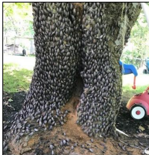
Figure 2. Aggregation of adult SLF in urban areas.

an agricultural pest, SLF may also be a nuisance pest in urban areas due to their aggregation behavior (Figure 2).