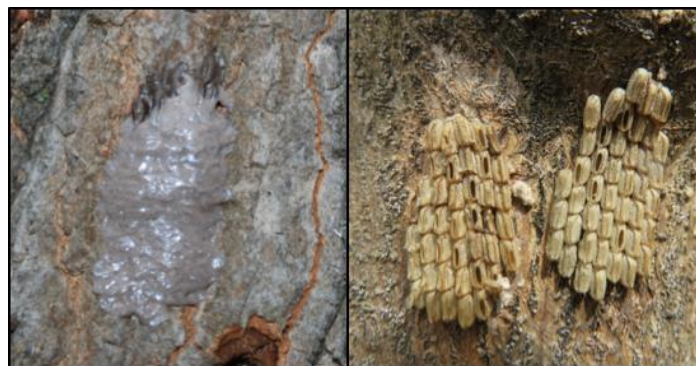
Figure 3. SLF eggs covered with waxy deposits (left) and seed-like eggs with holes where SLF nymphs have emerged (right).

In Pennsylvania, the spotted lanternfly has one generation per year. Nymphs emerge between May and June and go through four immature stages. Adults start to emerge by late July. SLF overwinter as eggs which are laid between September to November on smooth tree surfaces and inanimate objects such as telephone poles, stones, pallets, outdoor equipment, firewood, railway cars, vehicles, etc. SLF's behavior of laying eggs on non-plant items contributes to their wide dispersal ability and likelihood of unintentional introduction into new areas.