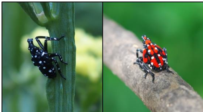
Figure 4. The first three immature stages are black with white spots (left) the fourth immature stage is red and black with white spots (right).

Each female produces one to two egg masses of 30 to 50 eggs each. Seed-like eggs are laid in multiple successive rows and covered with a yellowish-brown waxy deposit (Figure 3). The first three immature stages are black with white spots and lack wings. The fourth immature stage is red and black with white spots and possess small wing pads (Figure 4).