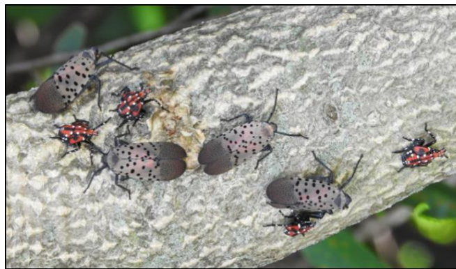
Figure 6. The fourth immature stage and adults of SLF.

The spotted lanternfly has the ability to negatively impact high value commodity crops in