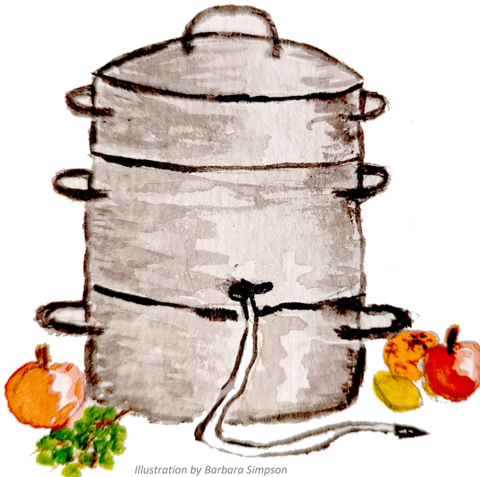
Illustration by Barbara Simpson

It is the policy of the University of California (UC) and the UC Division of Agriculture & Natural Resources not to engage in discrimination against or harassment of any person in any of its programs or activities (Complete nondiscrimination policy statement can be found at https://policy.ucop.edu/doc/1001004/Anti-Discrimination .)