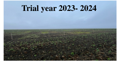
Trial year 2023- 2024