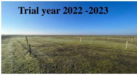
Trial year 2022 -2023