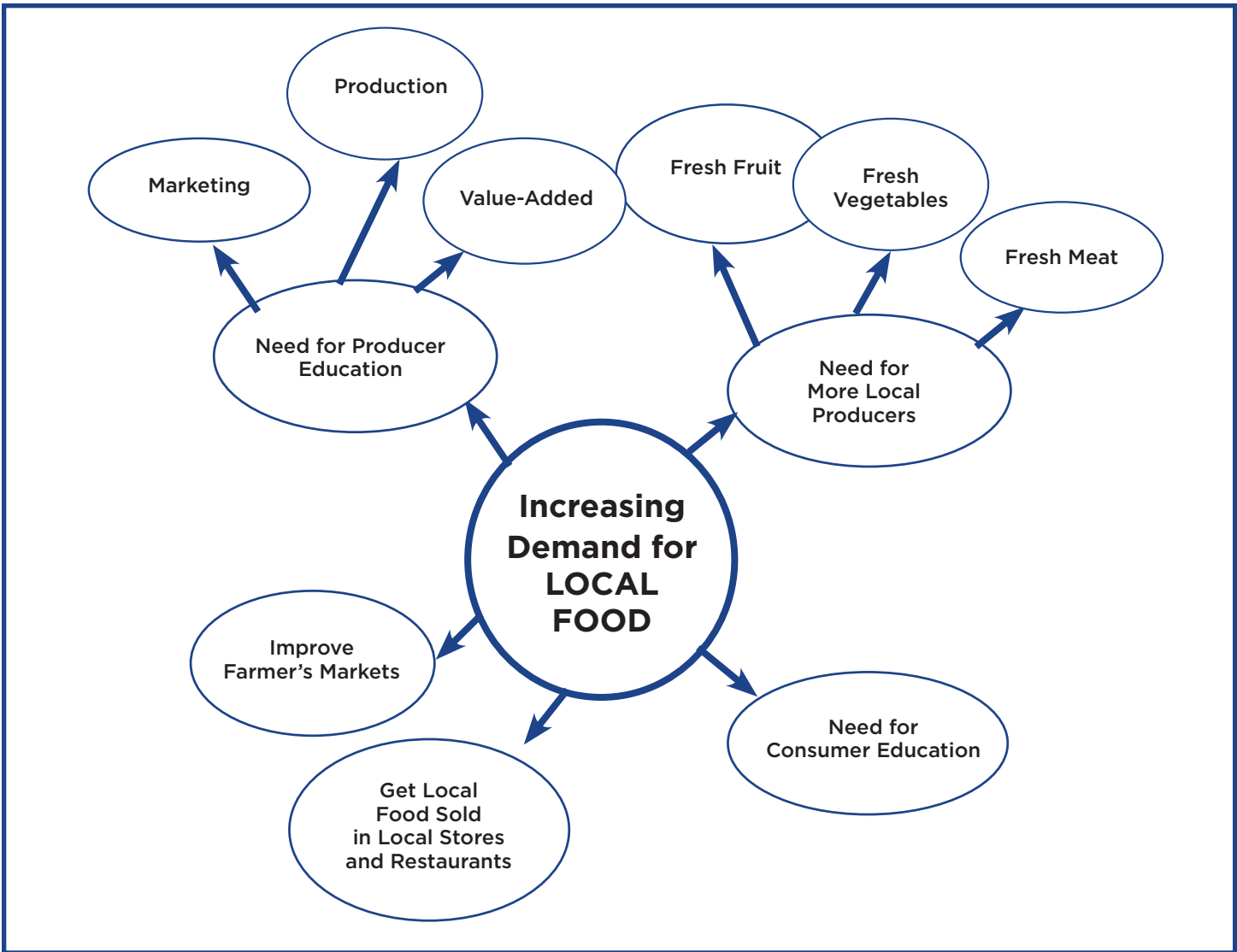
Figure 11. Example of a future wheel for brainstorming how to increase the demand for local food