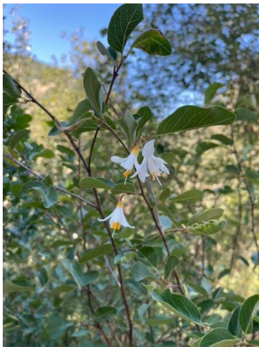
Styrax redivivus (Snowdrop Bush)

Bring a hat and water as we will be in the sunny garden for a short time before we retreat to the shade of the big walnut tree for more discussion and demonstrations.