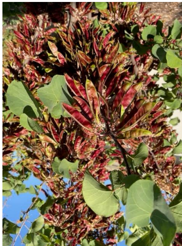
Cercis occidentalis (Western Redbud)