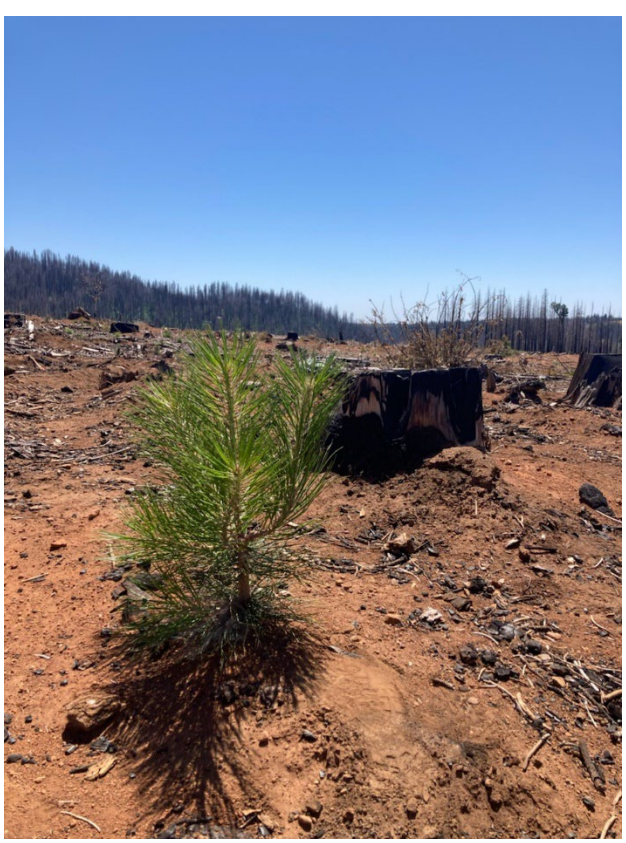
Figure 2. A healthy ponderosa pine seedling planted by the Caldor EFRT on private land in 2023. Severely burned, untreated forest land can be seen in the background.

for program-level work. Preparation ahead of a fire in the form of funding and guidance would improve program development and implementation, as would guidance from experienced local lead agencies once a fire has occurred.