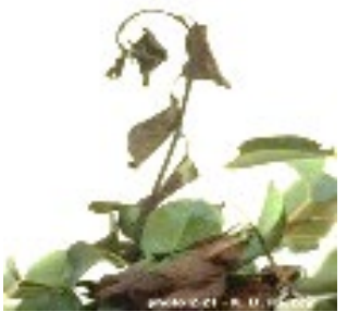
Figure 1Fire blight