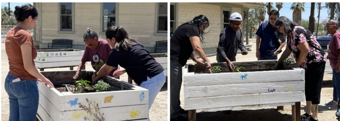
2023 Spring Planting Event with Torres Martinez Community Members