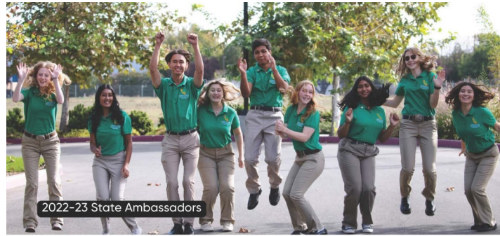
2022-23 State Ambassadors

Tag us in your posts so we can share your posts on the state sites