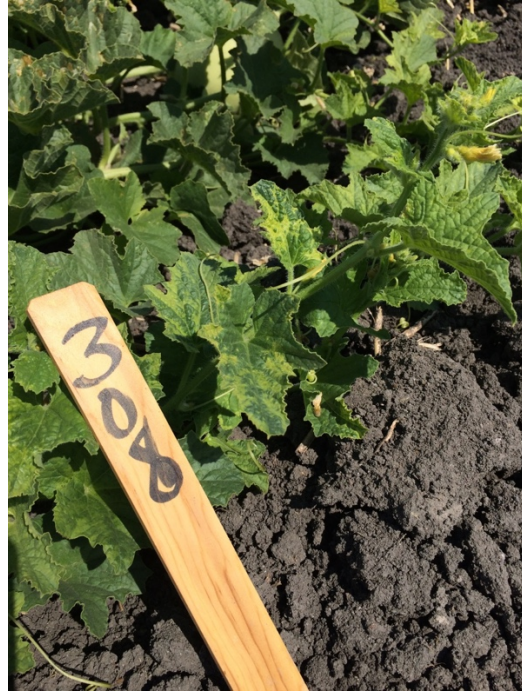
Figure 3. Treatment 8. Clethodim + Sandea + NIS.