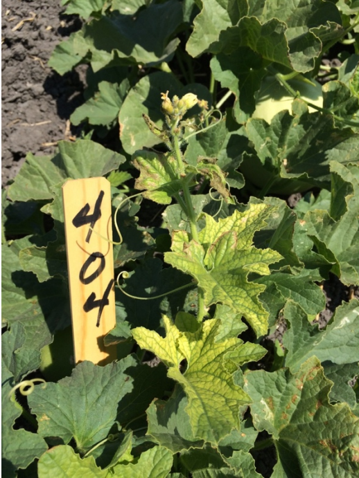
Figure 2. Treatment 4. Clethodim + COC.