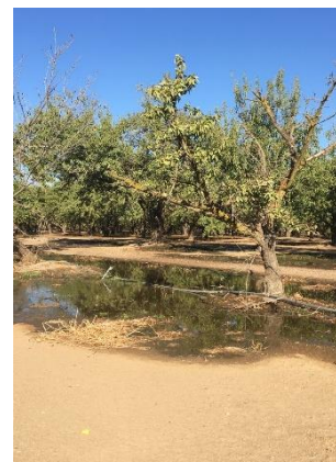
The Dangers of Irrigation Leaks