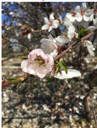
Craig Ledbetter on the USDA breeding program

Weekly episodes from Growing the Valley podcast keep you up to date with the latest UC best practices in almond, walnut, prune, and pistachio production! Listen at: growingthevalleypodcast.com or wherever you listen to podcasts.