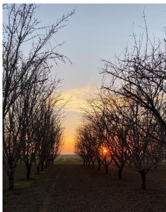
Field Evaluation of Almond Varieties