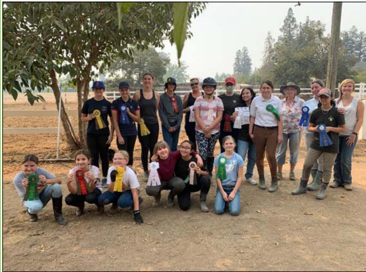
“Spy vs. Spy” County Horse Rally participants

I hope to see a lot of other 4-H members at the horse show at Academy Equestrian Station on November 13th! Non-horse spectators are always welcome to cheer on your favorite rider too!