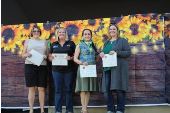
Figure 1- Thank you to our 4-H Club Key Leaders!