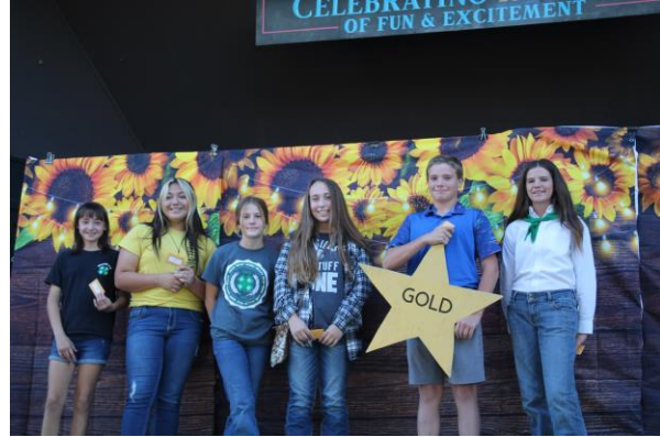
Figure 2- 4-H Members receive their gold stars.