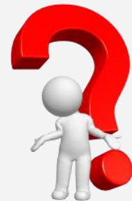
Vice President of ABA VACANT

FOR MORE INFORMATION ON COUNCIL AND TO VIEW THE MONTHLY AGENDAS & MINUTES, VISIT: http://ceglenn.ucanr.edu/Glenn County 4-H Program 286/4-H Council/ .