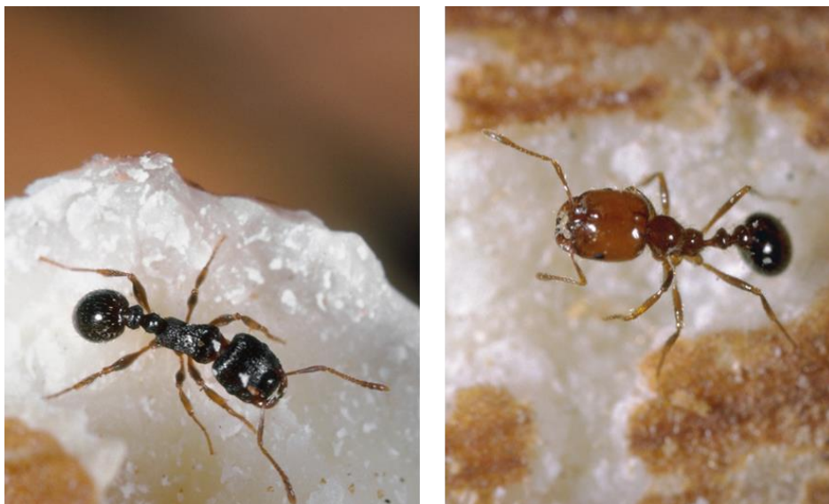
Table 1. Percent damage by southern fire ants to almonds on the ground in an almond orchard ( www2.ipm.ucanr.edu/agriculture/almond/Ants/ )

Photos 1 & 2. Protein feeding ants. Pavement ants (left) are dark brown, and are covered in coarse hairs. Southern fire ants (right) are characterized by an amber head and thorax and a black abdomen.