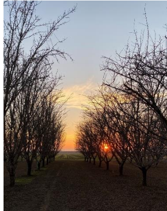
Field Evaluation of Almond Varieties