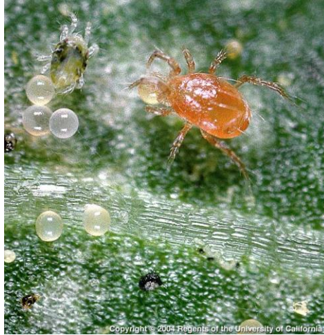
Photo 1. Predatory mite (right) eating the eggs of a spider mite (left).

In the Sacramento Valley there are two main predators to look for. The first are species of predatory mites (phytoseiids, Photo 1). These are good mites that eat the bad mites. Phytoseiids have a tear-dropped shape, a shiny appearance, and are often seen running around on leaf surfaces in search of food. They have historically been the main predators found in almond and walnut orchards in the Sacramento Valley.