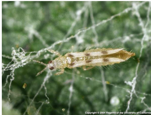
Photo 2. Sixspotted thrip adult, characterized by three dark spots on each of its two fringed wings.

The second predator that has become increasingly important over the past few years is the sixspotted thrip (Photo 2). This predator feeds almost exclusively on mites, can double its population every 4 days, thrives in hot dry conditions, and loves to navigate within spider mite webbing in search of food.