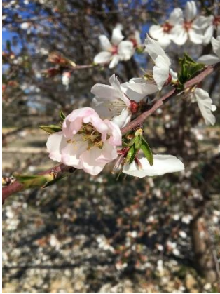
Craig Ledbetter on the USDA breeding program

Weekly episodes from Growing the Valley podcast keep you up to date with the latest UC best practices in almond, walnut, prune, and pistachio production! Listen at: growingthevalleypodcast.com or wherever you listen to podcasts.