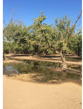
The Dangers of Irrigation Leaks