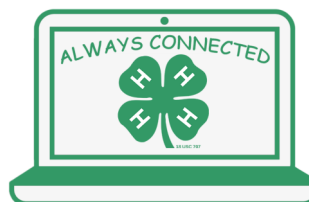
California 4-H Virtual Camp