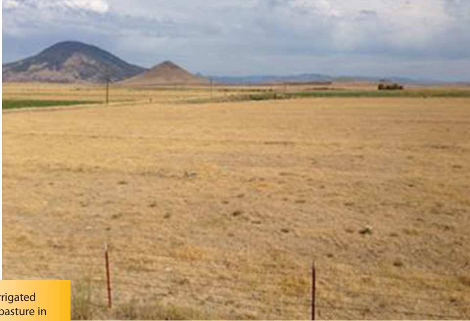
Figure 1. Irrigated tall fescue pasture in Shasta Valley, Siskiyou County, CA, after a season with only one spring irrigation, August 2014.

occasionally timothy ( Phleum pratense L.) in wetter sites. These cool-season grasses differ in drought tolerance, with studies ranking their drought tolerance, in order from highest tolerance to lowest, as tall fescue, orchardgrass, perennial ryegrass, and timothy (Waldron et al. 2002; Orloff and Putnam, unpublished data). Bromegrass species are another cool-season grass option for managing drought. Research has shown the yield of meadow brome and smooth brome to be less affected by deficit irrigation than tall fescue, orchardgrass, or perennial ryegrass (Waldron et al. 2002). Smooth bromegrass and timothy are better suited for intermountain and coastal areas of California and generally are not well adapted to Central Valley locations.