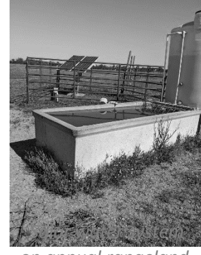
on annual rangeland.