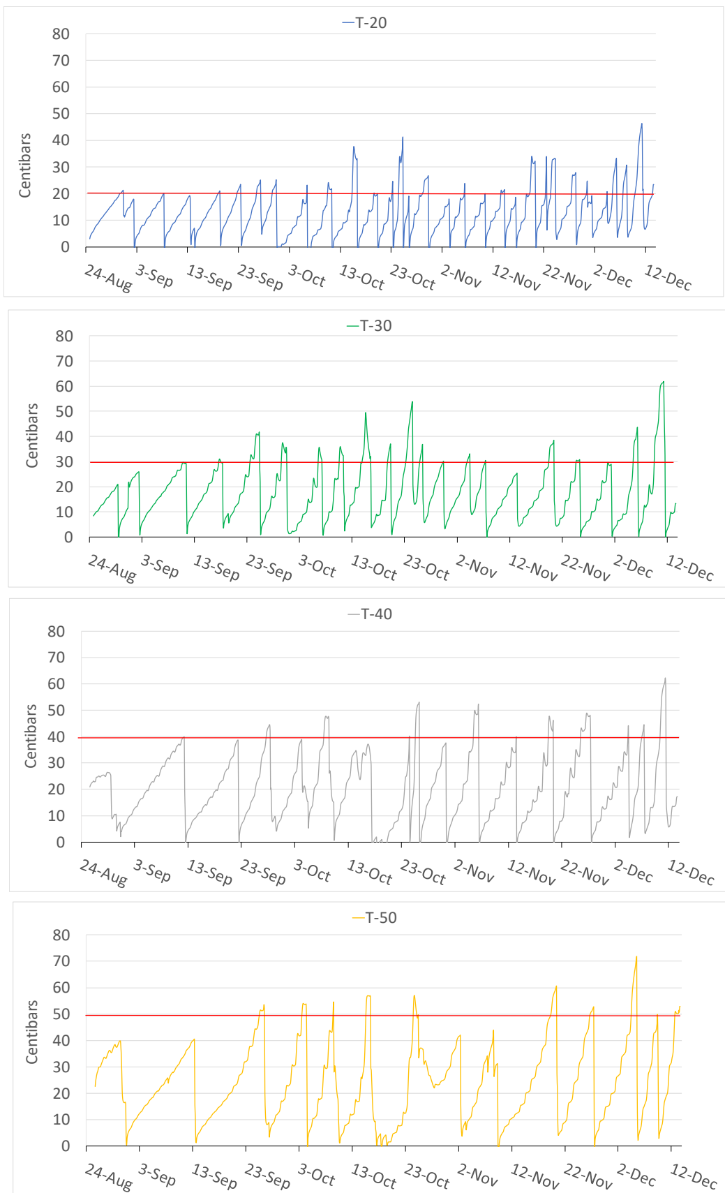
Figure 2. Soil water tension for treatments T-20, T-30, T-40 and T-50. The horizontal red bar in each graph indicates the target soil water tension threshold for starting the irrigation of each treatment.