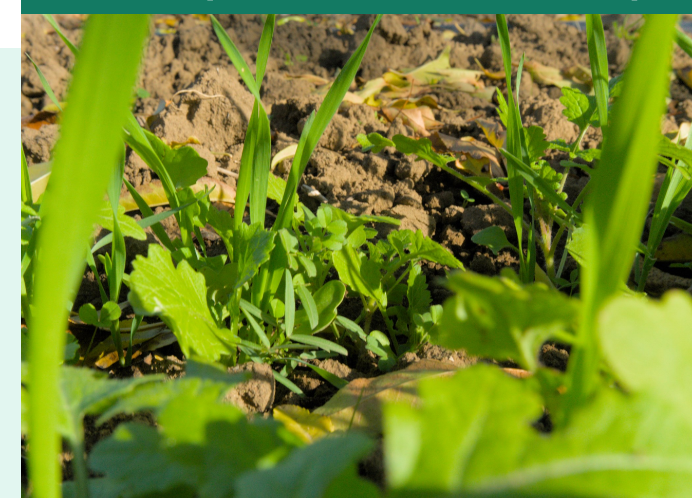
Multi-Species Cover Crop