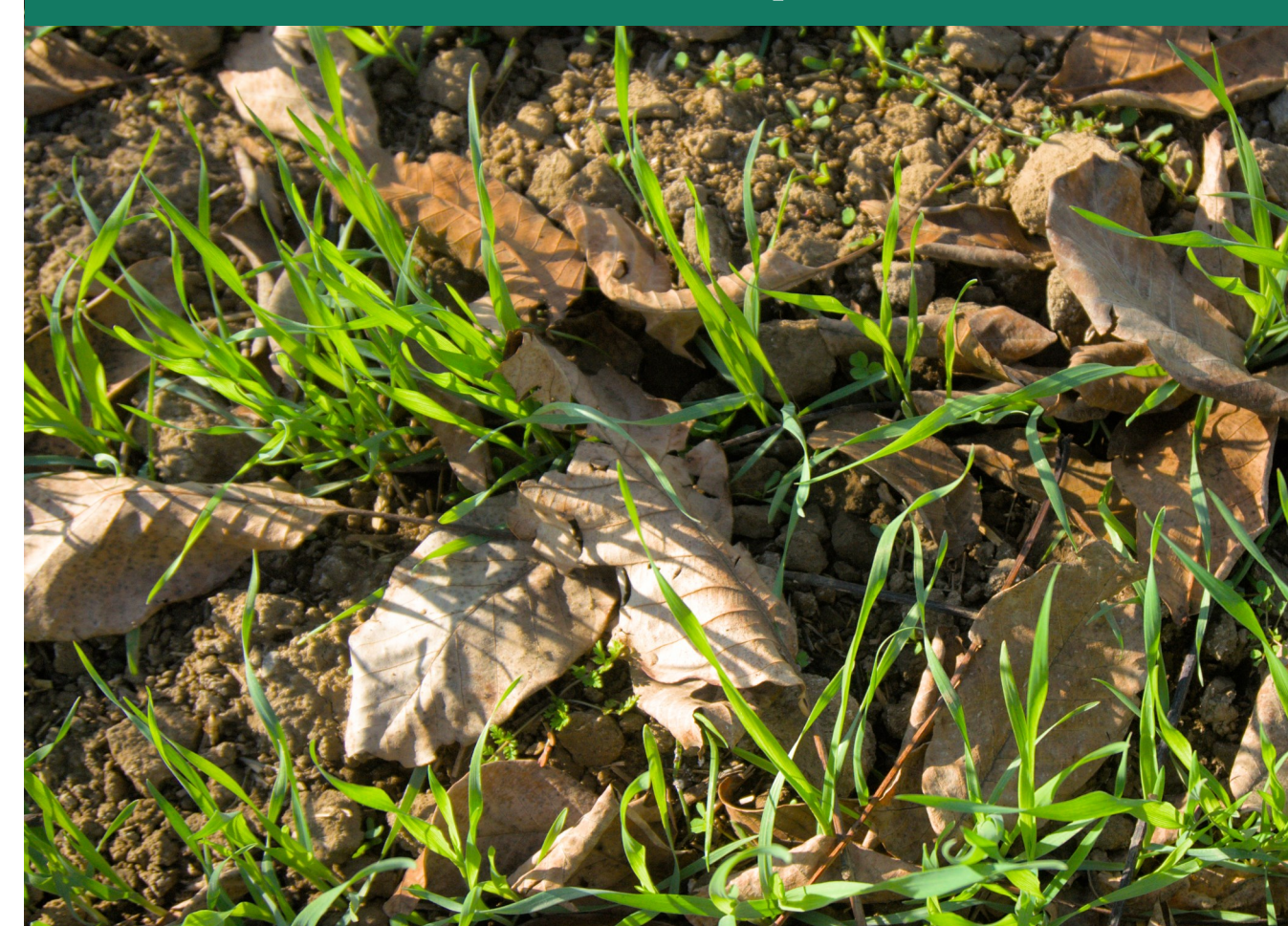
Basic Cover Crop