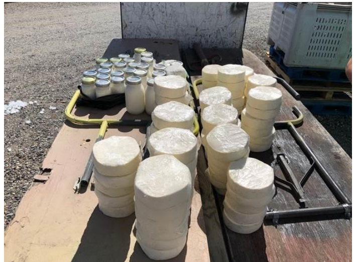
Figure 3. Unlicensed cheese for sale at flea market.

These directions are intended for preparing and consuming fresh cheese in your home. Preparation of cheese for distribution to the public (such as bazaars, farmers markets, grocers, and online sales) requires licensing and special facilities (see Figure 3). Please contact your local health department or state department of agriculture for more information.