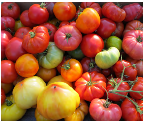
All varieties and sizes of tomatoes, including heirloom tomatoes, are preserved the same way.