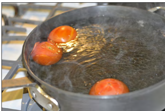
To remove the tomato skins, dip the tomatoes in boiling water for 30 to 60 seconds or until the skins split.