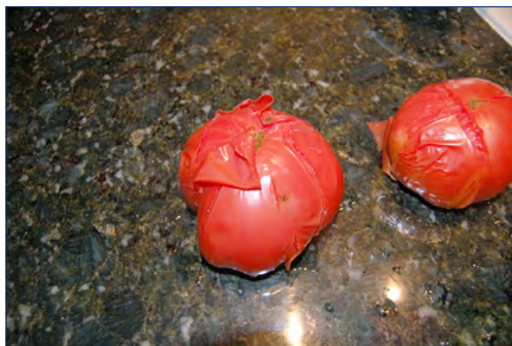
You should be able to slip off the skins.

skins by dipping them in boiling water for 30 to 60 seconds or until the skins split. You can score the tomatoes on the bottom with a knife before dipping in hot water to help with peeling. Dip them in cold water, then slip off the skins and remove the cores.