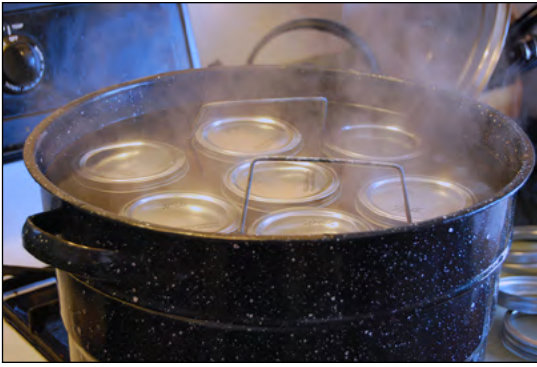
Start timing when water reaches a full, rolling boil.

reach 212°F. (See Table 1, page 7, for adjustments for altitude.) The heat setting may be lowered as long as a gentle but steady boil is maintained for the entire processing time. Add boiling water to keep jars covered, if necessary.