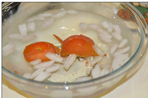
Dip them in cold water.