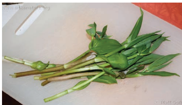
Wild Cucumber (Streptopus amplexifolius) ready to be chopped up for salad.