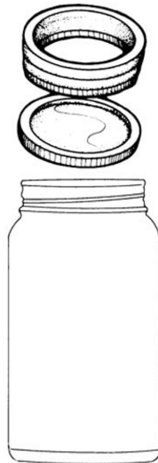
Figure 2. Mason jar with two-piece lid.

Do not retighten lids after processing jars. As jars cool, the contents in the jar contract, pulling the self-sealing lid firmly against the jar to form a high vacuum.