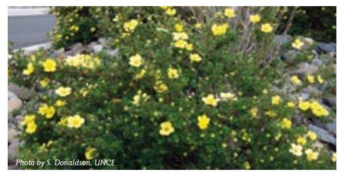
Cinquefoil (Potentilla fruticosa)