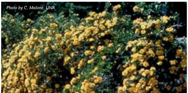
Harrison's Yellow Rose (Rosa harisonii)