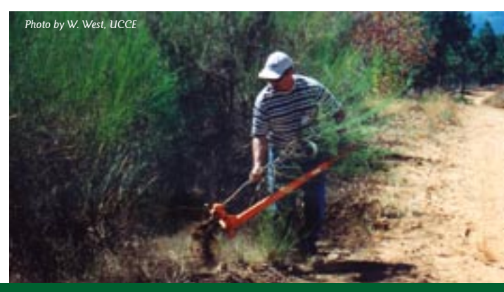
A weed wrench aids in uprooting plants.

If mechanical methods cannot be used, there are many herbicides that are effective on broom. Contact your local county agriculture department or pest control advisor for assistance. Herbicides that are readily available to homeowners include glyphosate and triclopyr. Spray the plant thoroughly just as the flowers are blooming. Be careful to avoid contact with desirable plants that may be harmed by the herbicide. Always follow all label instructions.