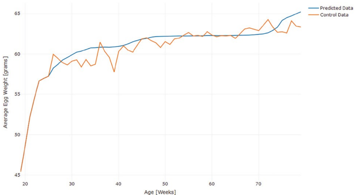
Figure 2. Comparison of random forest prediction data against control data for average egg weight over the lifespan of a flock. The mean absolute error (MAE) is 1.547 grams and the root mean square (RMS) error is 3.172 grams. The average error between the predicted and actual egg weigh was determined to be less than 3% using data (i.e., egg weight, mortality, average bird weight, bird age, and total eggs produced) from the prior week.

Supervised and unsupervised learning are the two major classifications of ML. Supervised learning algorithms have a target continuous or categorical variable (i.e., regression, recursive partitioning algorithms), while unsupervised learning algorithms do not have a target variable or known label(s) within a variable; they have to search for them via techniques such as cluster analysis [35]. The following is a review of various relevant ML-based methods in poultry food safety and production which represent a group of