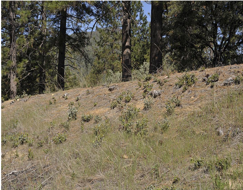
Sprouting Whiteleaf Manzanita one year after bushes were cut down by hand as part of a CALFIRE fuel break project