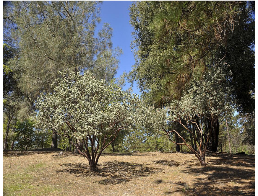
Area one year post-treatment with herbicide. Stumps pulled with tractor. Two mature bushes left as specimens.