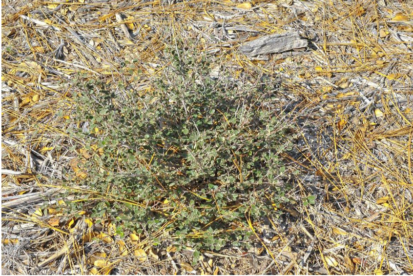
Re-sprouting ceanothus, 8", 2 years post-treatment