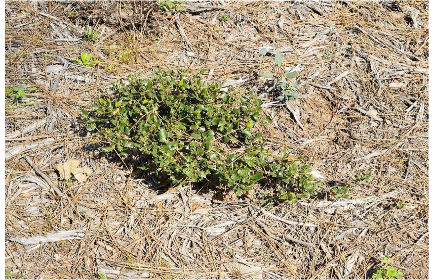
Re-sprouting live oak, 8", 2 years post-treatment

Brush that has been cut off at or near the ground can re-sprout, and grow back into a large scrub bush within a few years. Treat it after it is about 9 inches high, preferably in the early fall. Triclopyr-based herbicide is the treatment of choice for re-sprouting brush. The dead plant may then be cut off with a chainsaw if the landowner wishes.