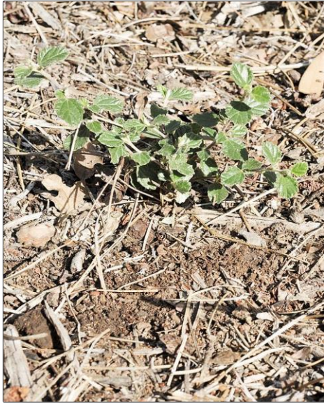
6" Seedling Ceanothus (Deerbrush)