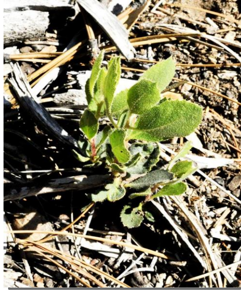
6" Seedling Manzanita