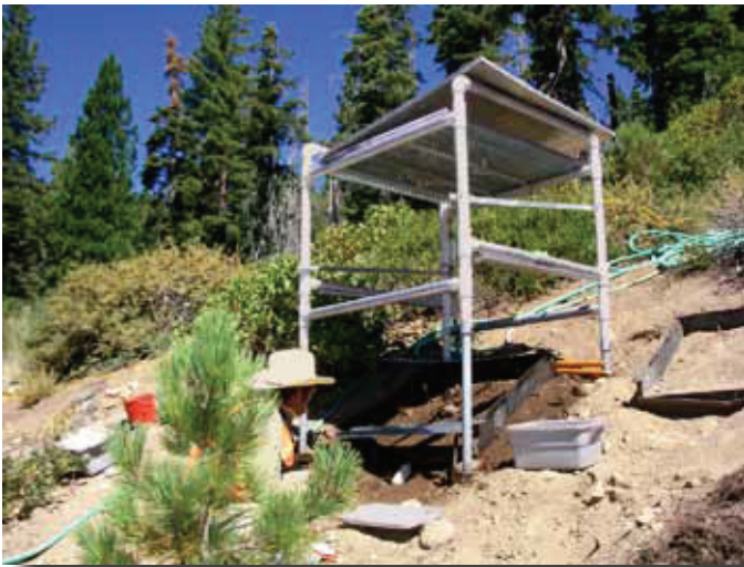
Rainfall simulation is a tool that is used to simulate rainstorms and directly measure surface erosion and infiltration rates.

*The duff fire risk results are based on one study and may vary based on climatic factors and duff composition.