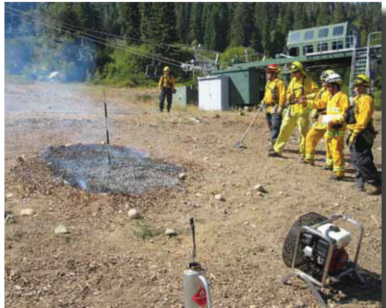
The study team partnered with local fire districts to measure burn characteristics of different mulches.