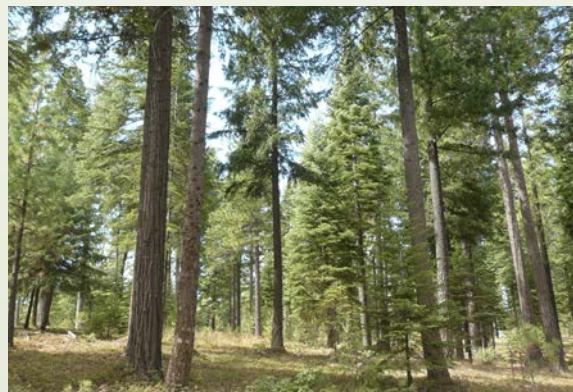
A managed forest has vegetation that has been modified to reduce the risk of the spread of fire.

To restore forest health and improve fire safety to your lands, the key is to reduce the number of trees and shrubs, remove excess woody debris left by wildfire and bark beetle damage, and replant trees in deforested areas. NRCS can help you plan actions to improve forest health and wildfire safety on your property and provide financial assistance to get the work done.