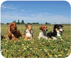
Figure 8 ..... 10