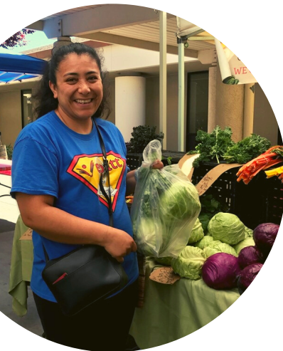
EFNEP graduate redeems farmers' market voucher in San Mateo County