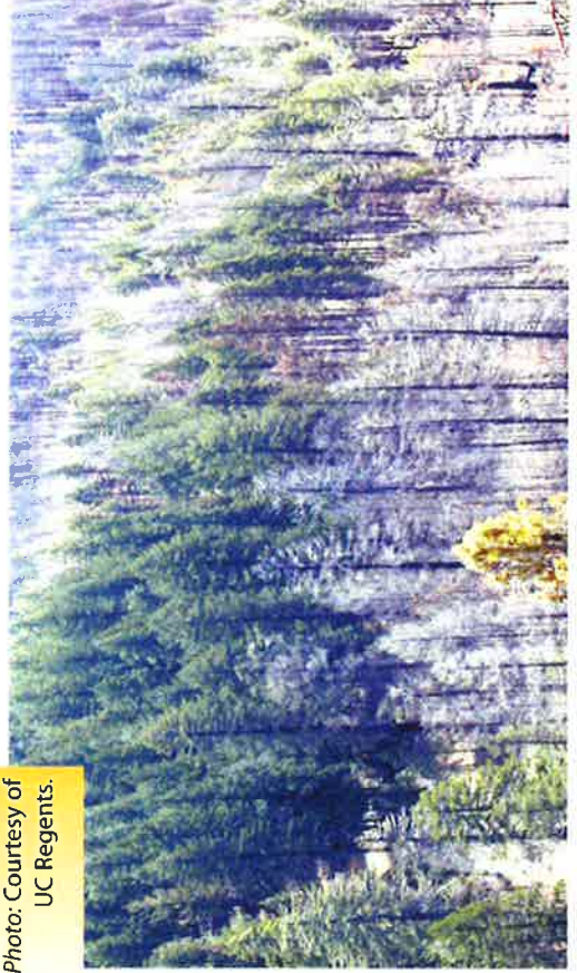
Figure 4. Small patch of high-severity burn. Note live trees that can act as seed sources in the background and regenerating trees in the foreground.