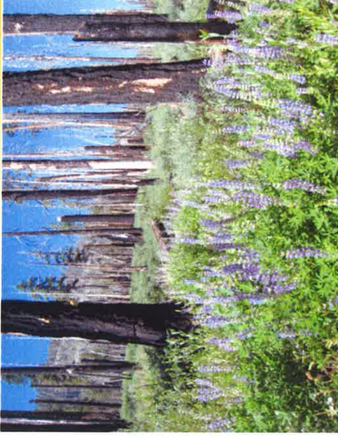
Figure 6. Postfire herbaceous plant response.

Many flowering plants and grasses have long-lived seed banks in the soil or mechanisms that enable them to sprout from their roots after fire. In some places, the postfire response of these plants can be quite vigorous, as the death of the larger trees has freed up resources for them to capture. Some plant seeds depend on fire to germinate, and some species can only grow in the conditions that occur during the first few years following a fire. In areas where the soil experienced very high burn severity, the fire may have killed