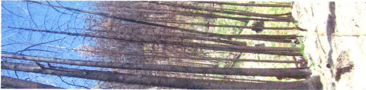
Straw mulch spread across a slope burned by the 2013 Rim fire in Stanislaus National Forest. The mulch is used to protect the soil from erosion caused by rain.

Straw mulch has high efficacy in reducing rainwater runoff, soil erosion, and downstream sedimentation when the mulch covers 60 to 80 percent of the soil surface. Drawbacks to mulch application include the time and expense involved and the potential to introduce non-native species, even when certified weed-free straw is used. Rice straw has been proposed as a safe alternative to wheat straw, because the weeds of a wet rice field were thought unlikely to germinate in mixed-conifer forest habitat. However, several non-native species, including a noxious weed, were introduced through rice mulch on recent wildfires in central California. Given its efficacy in erosion control, mulch is still a good choice in areas at high risk of erosion, but it should be accompanied by monitoring for non-natives and treatments if necessary.