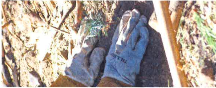
One-year-old seedling planted in a burned area with masticated material (mulch) around it.

preparation and tree planting, see Forest Stewardship Series 7 on forest regeneration (UC ANR Publication 8237).