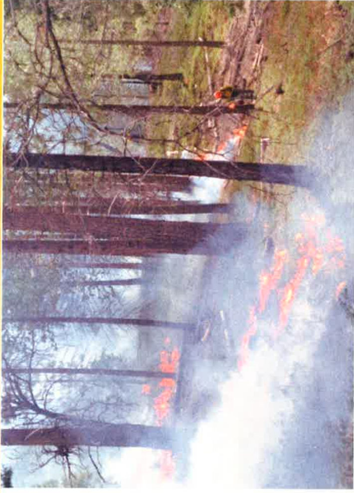
Figure 1. Low-severity prescribed fire, burning on the forest floor.

It is important to identify the fire's effects on all sections of your property because, despite the common initial impression that an individual fire is "severe," all wildfires include a variety of severities within their perimeter, and these different severity classes may be present on your property. Understanding variations in the distribution of severity across the landscape is important because it not only describes the current, immediate effects, but it can also help predict likely longer-term changes. The generalizations about fire's effects listed here apply mainly to forested ecosystems in California, with emphasis on yellow pine and mixed-conifer forests, and it is important to recall that different forest types within California respond somewhat differently. Despite these differences, much of the overview of potential ecological effects and landowner concerns in relation to severity classes can be applied to other forested landscapes.