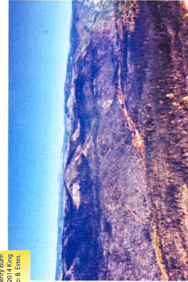
Figure 5. Large patch of high-severity burn from the 2014 King fire.

effects. These patches can lead to the large-scale loss of forested wildlife habitats, which are important to many common as well as declining wildlife species such as the Pacific fisher and the California spotted owl. They can also impact the soil so severely that seeds and nutrients stored in the soil are lost. The loss of forest litter (fresh and decayed needles, leaves, and branches on the forest floor) can increase soil erosion, which has significant effects on waterways and streams. One of the biggest concerns is that, in large patches where all trees have been killed by the fire, natural conifer forest regeneration may be delayed because of the increased distances to live tree seed sources. In addition, there is often a very vigorous native shrub response, since existing shrubs can sprout from their roots after being top-killed, and many new shrubs can germinate because the seeds in the soil are often stimulated by wildfire. These dense shrubs compete with conifer seedlings for soil and light, and so they may crowd out naturally occurring seedlings. Long-term, large patches of high severity can contribute to high fuel loads when all of the dead trees fall. When the area burns again, this can cause excessive soil heating.