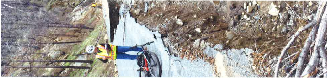
Road damage from postfire soil erosion that occurred in a severely burned area after heavy winter rains.

Hazard tree removal is the removal of individual dead trees or fire-weakened trees that are at risk of falling on people, structures, trails, or roadways. The primary goal of hazard tree removal is safety. Dead trees that threaten homes and roads should be removed as soon as possible after the fire. Trees that have been substantially damaged, with little green canopy and high levels of bark char, are at higher risk for death in the near future, and so it is more efficient to remove these at the same time as dead trees are removed. Some property owners may want to retain trees they feel have a chance of recovery. In such cases, the opinion of a licensed arborist or RPF on the likelihood of tree recovery may be useful, although tree mortality can sometimes be difficult to predict, even