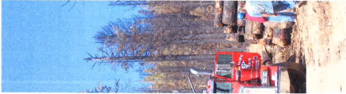
Salvage harvesting after the 2007 Angora fire.

Salvage operations can include complete or partial harvests of all merchantable trees. The number of trees to cut or leave will depend on your objectives, your plans for reforestation, and whether or not your roads are in good enough condition to support the harvest operation. Landowners should consider leaving behind some dead trees for wildlife habitat. The forest roads will need to meet current regulatory standards at the time of harvest. The market and local mill capacity will also play a role in the amount of wood that can be harvested and delivered to a mill. The distance to a mill is likely the greatest determinant of the economic profitability or cost of the operation. With the rise of large fires and increased tree mortality in some regions of California, many mills are continually operating at maximum capacity, which means they often do not have the capacity to buy logs from smaller landowners. This greatly reduces the ability of landowners in those regions to remove dead trees in a cost-effective manner. All harvest operations should include mitigations for potential non-native species introductions from equipment.