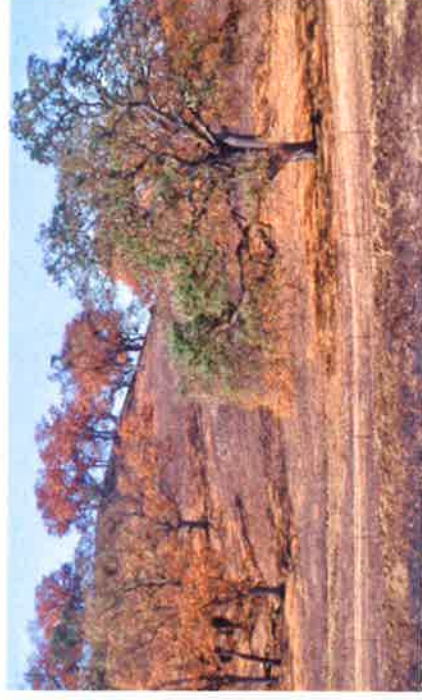
Figure 8. Burned oak woodland. Many of the trees with dead crowns survive by sprouting from their crown or base.