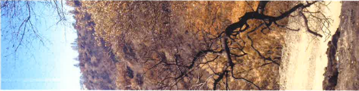
A forest road where the 2014 Sand fire burned directly above and below. The road system should be assessed after a fire to identify any increase in soil erosion potential.