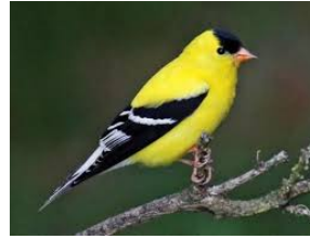
American Gold Finch