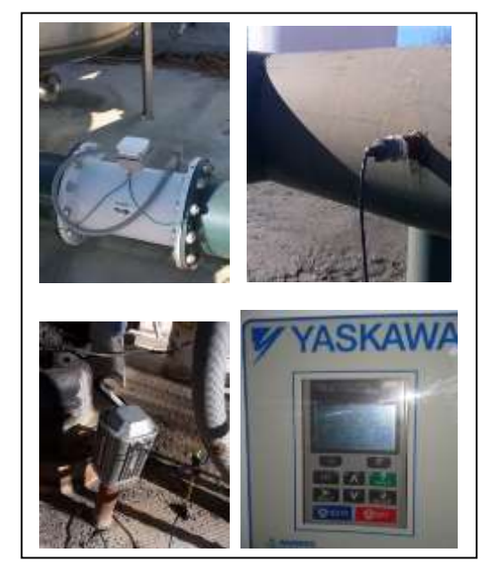
Figure 3. Magnetic flow meter (upper left), pressure transducer (upper right), acoustic groundwater level sensor (lower left), and VFD digital control panel (lower right).

Figure 2. Schematic showing orchard irrigation system beginning with the well and pumping plant and extending out to the last lateral line and sprinkler or dripper.