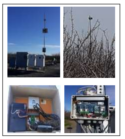
Figure 7. Parts of a telemetry system. Cell tower and gateway next to pump controls (top left), gateway connection to internet (bottom left), orchard cell tower connected to sensors in the field (top right); and node connection to field sensors (bottom right).

Once some needs have been identified and prioritized, it may make sense to try the technology on a partial scale or even manually to establish proof of concept, robustness, and effectiveness on the way towards automation and broader adoption