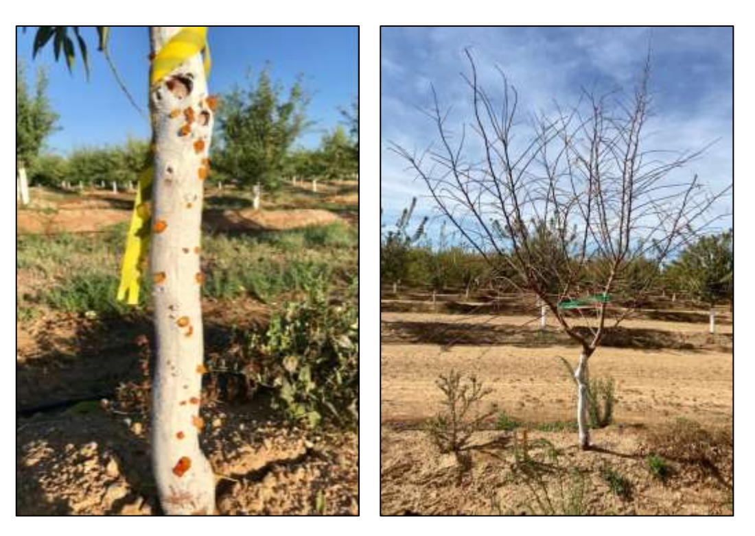
Figure. 1 Herbicide Damage in 2^{nd} leaf almonds. Glufosinate + Glyphosate (1.5 + 2.75lbs/ac). Image on the left is trunk gummosis observed 5 weeks after treatment. Image on the right shows complete defoliation of the same tree 12 weeks after treatment