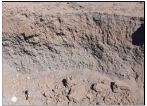
Figure 4. Layered orchard soil considered for soil modification and/or zone irrigation management.

Remote implies "from afar" and not actually being there in person. Data acquisition is a process of collecting signals from various sensors that measure real-world physical conditions. "Telemetry" (Figure 7) is the means of gathering and transmitting the data to a collection point. After the signals are received