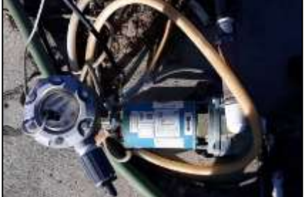
Figure 5. Pressure transducer on irrigation line (top) and flow meter on injection pump (bottom).