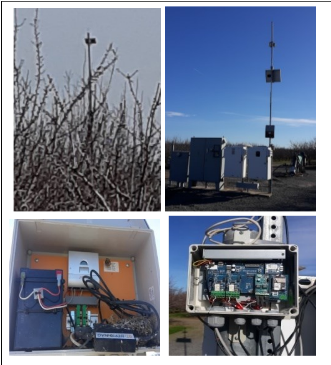
Figure 7. Parts of a telemetry system. Cell tower and gateway next to pump controls (top left), gateway connection to internet (bottom left), orchard cell tower connected to sensors in the field (top right); and node connection to field sensors (bottom right).

Once some needs have been identified and prioritized, it may make sense to try the technology on a partial scale or even manually to establish proof of concept, robustness, and effectiveness on the way towards automation and broader adoption.