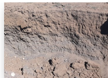
Figure 4. Layered orchard soil considered for soil modification and/or zone irrigation management.