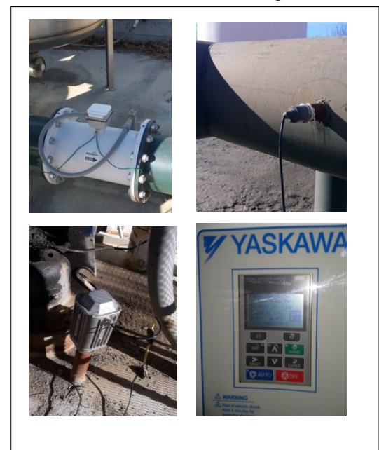
Figure 3. Magnetic flow meter (upper left), pressure transducer (upper right), acoustic groundwater level sensor (lower left), and VFD digital control panel (lower right).