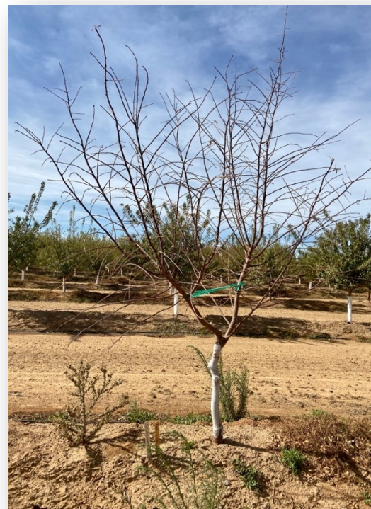
Figure. 1 Herbicide Damage in 2 nd leaf almonds. Glufosinate + Glyphosate (1.5 + 2.75lbs/ac). Image on the left is trunk gummosis observed 5 weeks after treatment. Image on the right shows complete defoliation of the same tree 12 weeks after treatment.