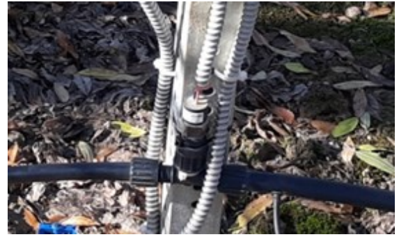
Figure 5. Pressure transducer on irrigation line (top) and flow meter on injection pump (bottom).

It is becoming easier to collect and analyze pressure and flow data from an irrigation system. Pressure gauges or transducers (Figure 5) can be installed in drip or microsprinkler lines intermittently across an irrigation system to verify the system is operating as designed and according to schedule. This allows a quick response, if needed, or the option to save the historical data for later management review. Small flow meters can also be installed on injection pumps to verify chemigation and fertilization efforts are going as planned.