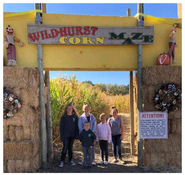
Big Valley Club Field Trip