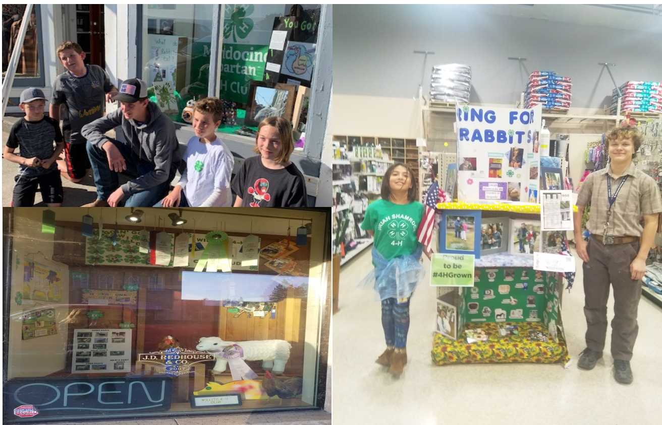
Top left: Mendocino ; Right: Ukiah; Bottom Left: Willits

During National 4-H Week, some of our Clubs put together 4-H displays to show off to their local communities!