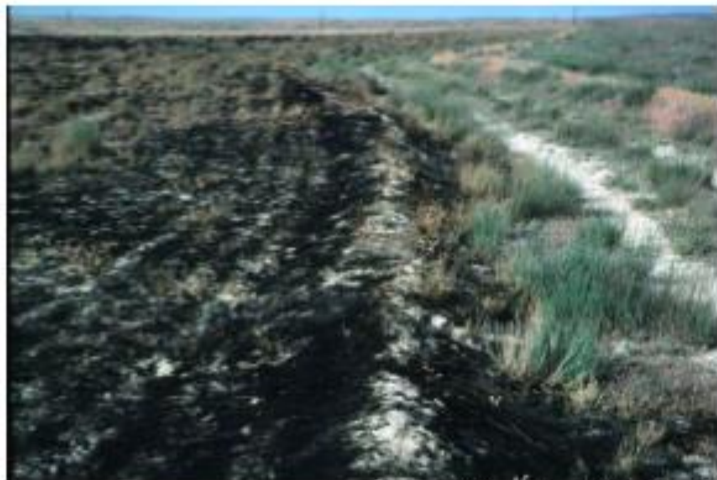
Forage kochia firebreak