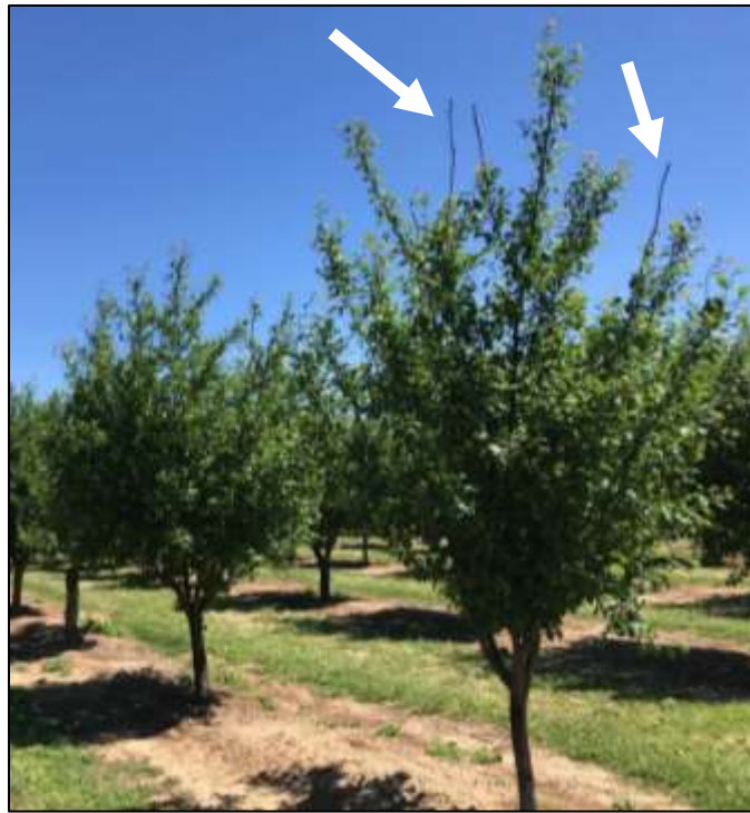
Photo 1. Orchard with branch tip dieback (see arrows) suspected to be from a dormant oil application.

Oil Damage. Some tip dieback at the tops of trees was observed in many orchards this spring. This discrete dieback of upright branch tips occurred in orchards that received a dormant horticultural oil application and is consistent with how oil burn presents (photo 1). Oil was applied to this block during dormancy (2-3 gallons December/January). Although oil can help provide effective control of scale insects, drying weather before application (e.g. a drying north wind) can lead to phytotoxicity “burn” and dieback.