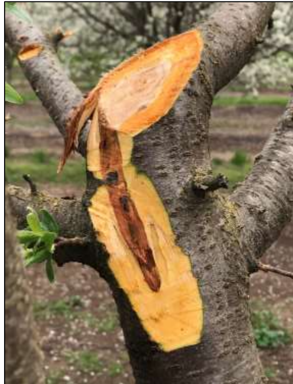
Photo 4 & 5. Orchard with canker dieback was first noticed last year when trees were not flowering out, except low in the canopy (photo 4). Cutting back one tree to see how extensive the canker damage had spread (photo 5) showed that damage continued to grow down to a primary scaffold.

We want to thank the laboratory of Dr. Themis Michailides for their support in diagnosis.