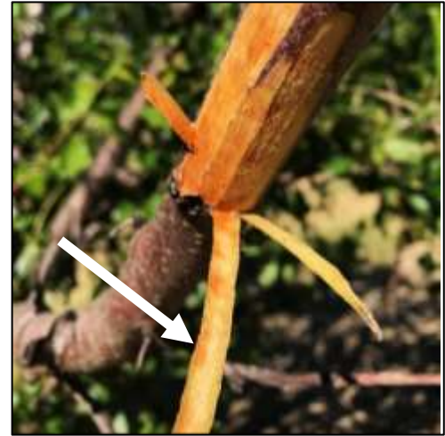
Photo 2 & 3. Select patches of trees in this orchard show the extensive dieback (photo 2) consistent with bacterial canker. The field diagnosis of bacterial canker was supported by the tell-tale signs of flecks (see arrow, photo 3), as well as the fermented/sour-smell associated with the sour sap phase of bacterial canker decline.

Cytospora. Cytospora infections can be found in virtually all mature California prune orchards. Predisposing damage that allows for Cytospora , as well as Botryosphaeria canker infection, include breaking of the bark from sunburn, potassium dieback, bacterial canker, ring nematode, and pruning wounds. Canker infection through pruning wounds is an especially great concern when there is mechanical hedging or topping that make thousands of indiscriminate pruning wounds that are potential entry points for rain-splashed fungal spores. For example, in one orchard that was mechanically boxed in the fall of 2017, Cytospora was subsequently diagnosed during the following 2018 bloom when some trees were not flowering out, except low in the canopy (photo 4). Because Cytospora cankers are perennial and will continue to grow and spread unless they are cut out, one year later during the 2019 bloom, the canker on one tree had spread all the way down to a primary scaffold (photo 5).