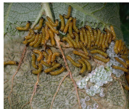
Figure 3. Young redhumped caterpillars and hatched eggs.