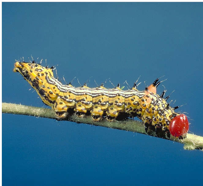
Figure 1. The redhumped caterpillar, Schizura concinna .

This pest most commonly chews leaves of liquidambar (sweet gum), plum, and walnut. It also feeds on almond, apple, apricot, birch, cherry, cottonwood, pear, prune, redbud, willow, and other deciduous trees and shrubs.