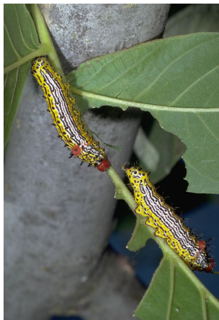
Figure 4. Older redhumped caterpillar larvae.