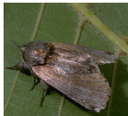
Figure 6. Redhumped caterpillar moth.