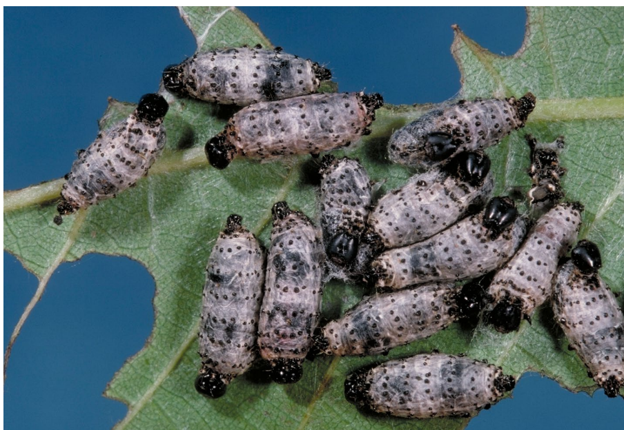
Figure 10. Redhumped caterpillars parasitized by Hyposoter fugitivus .

Clip off shoots that contain caterpillars while the insects are young and feeding in groups. At this stage, you'll need to prune off only the infested shoot terminals to destroy a large group of caterpillars (Figures 3 and 8). Crush the caterpillars, or dispose of them in a plastic bag in the trash.