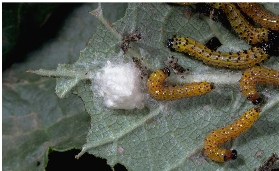
Figure 9. White cocoons of Cotesia (Apanteles) schizurae .

Trichogramma spp. wasps feed as larvae inside moth eggs, causing