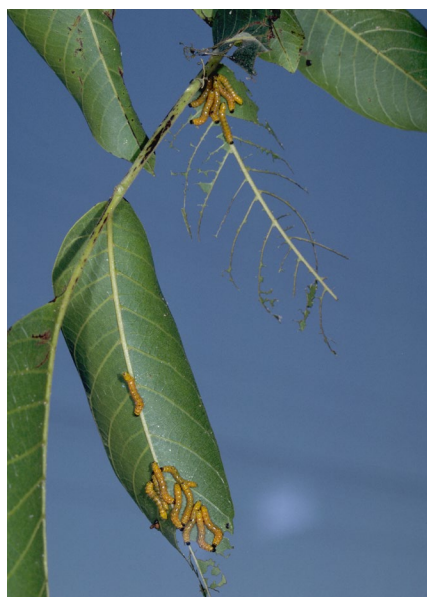
Figure 8. Redhumped caterpillar feeding, skeletonized walnut leaves.

pillars chew all the way through and consume leaves, leaving only the larger, tough veins (Figure 8). Unlike certain other caterpillars that may feed on the same hosts, redhumped caterpillars do not tie leaves with webbing or leave silk strands on foliage; the exception is when silk-covered pupae occur on leaves.