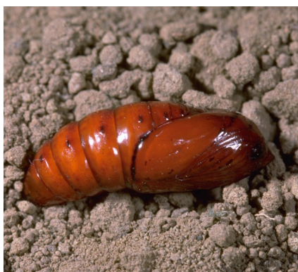
Figure 5. Redhumped caterpillar pupa.

Young caterpillars commonly feed side-by-side in groups, chewing on the lower leaf surface (Figure 3). As the larvae grow, they tend to disperse and feed in smaller groups or individually. Skeletonized leaves are a common result, as the older cater-