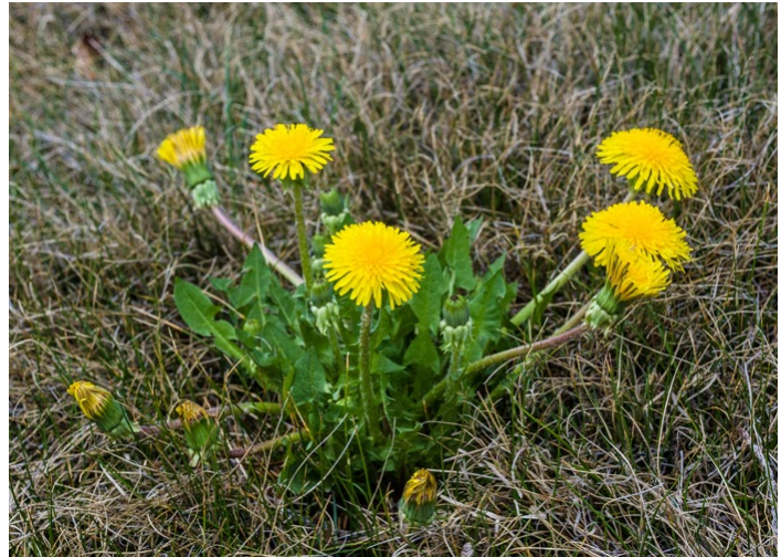
Figure 1. Mature dandelion plant, Taraxacum officinale .

Dandelion, Taraxacum officinale (Figure 1), also known as lion’s tooth, puffball, blowball, and monk’s head, is a major problem in home lawns, commercial turf, ornamental plantings, pastures, and tree and vine crops. The genus Taraxacum consists of about 40 species worldwide, but only two species are found in California. Taraxacum officinale is found as a weed throughout California and T. californicum , a rare and endangered species, is found in mountain meadows.