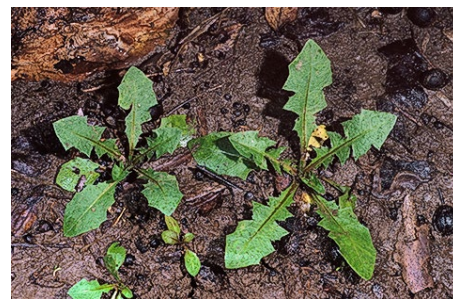
Figure 8. Dandelion seedlings.