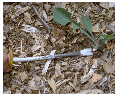
Figure 9. A dandelion knife can be used to remove weeds.

Some preemergence herbicides such as those containing dithiopyr or isoxaben