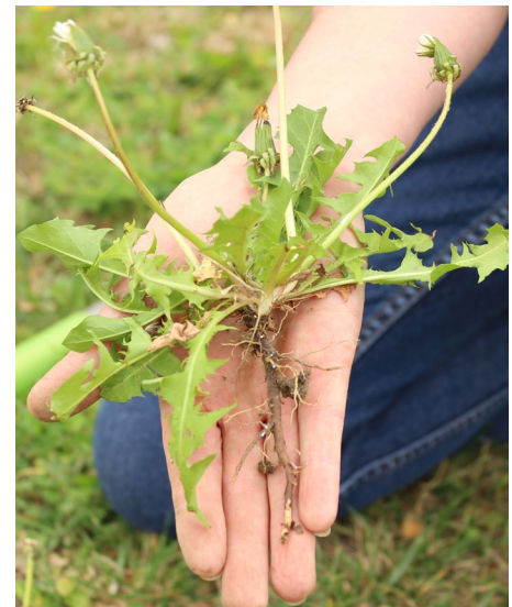
Figure 2. Dandelion plant, showing taproot.

Flowering stalks are 6 to 24 inches in length and terminate in a compound inflorescence or head that contains 100 to 300 ray flowers (Figure 4). Each ray flower has a strap-shaped yellow petal (Figure 5) with five notches at the tip. Dandelion flowers are not normally