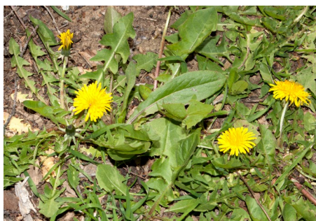
Figure 4. Flowering dandelion plants.

these achenes form the characteristic puffball (Figure 7), allowing the seed to be transported via wind currents for miles.