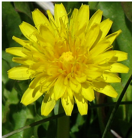
Figure 5. Ray flowers of California dandelion, Taraxacum californicum .

Flowering begins early and continues throughout the life of the plant. Dandelion plants can survive for many years,