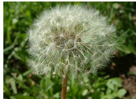
Figure 7. Dandelion plants at fruiting stage.

Dandelions can form a dense mat of leaves (6 to 14 inches in diameter), that can crowd out desirable species and reduce the vigor of those plants that survive. In turf, it forms clumps that cause poor footing for athletic fields and golf courses. Dandelion's texture and color vary from that of turfgrass, and the yellow flowers reduce the aesthetic quality of the lawns and other turf areas. Dandelion flowers may attract bees, which can be problematic where children or people with bee allergies are present.