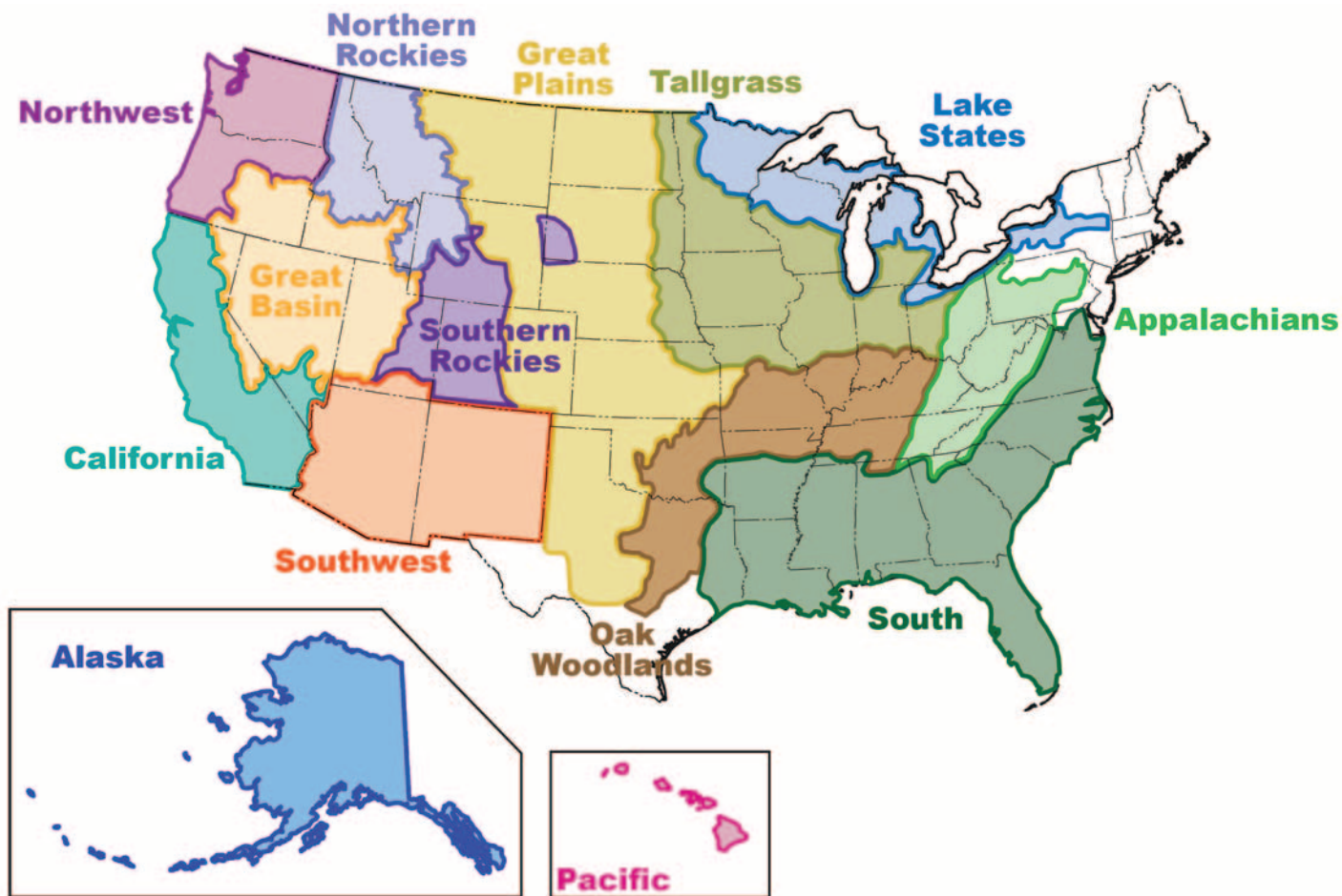
Figure 1. Map of the JFSP fire knowledge exchange consortia regions in 2012.