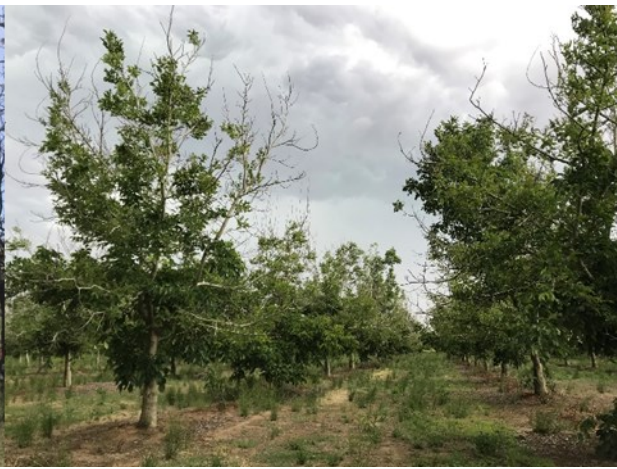
Photo 1 & 2. Very little leaf out in this part of a Gridley, CA Chandler orchard on April 22 nd (photo 1). Significant canopy development in the same orchard by May 30 th.