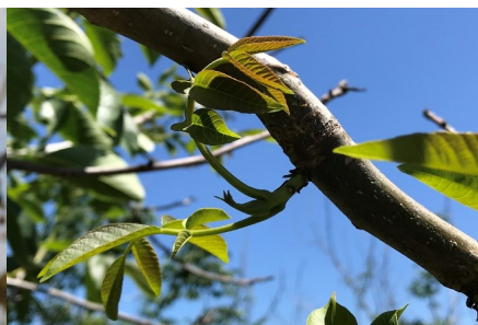
Photo 7 & 8. On otherwise blank branches, some adventitious buds were beginning to push on this Howard tree on April 19 (photo 7). These adventitious buds have continued to break (photo 8) much more recently (photo May 31 st ).