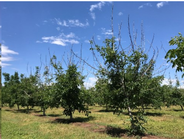
Photos 5 & 6. Clusters of severely affected trees that did not leaf out on April 22 nd (photo 5). Substantial canopy growth from the lower/central portion (photo 6) of most of the affected trees in this orchard on May 31 st.