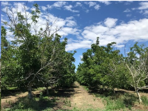
Photo 3 & 4. Two trees with very little leaf out at the edge of a Chandler orchard northwest of Chico, CA on April 22 nd (photo 3). Significant canopy development (photo 4) of the same two trees on May 31 st.