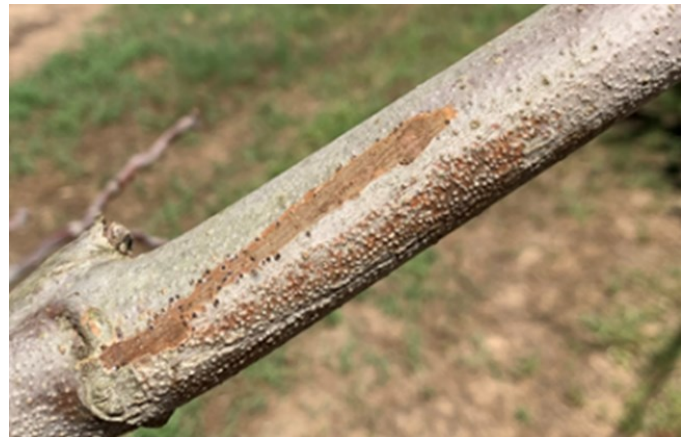
Photo 11. Freeze damaged limb from a Yuba City Howard orchard on June 6, 2019. Note raised “bumps” on bark and black pycnidia (see arrow) that produce spores below bark typical of Bot and Phomopsis

Photos 9 & 10. Selective chainsaw cuts made to a 7 th leaf Chandler orchard in Yuba County on May 31 st . Photo 9 shows a partially pruned back tree, while photo 10 shows an unpruned row on the left and a pruned row on the right. This severely damaged area was ~13 acres within a 500-acre Chandler orchard on sandy loam soil. The area damaged received only 2 inches of water in mid-October, whereas the undamaged remainder of the orchard received 4 inches of water and later in October. The only exception was one other block which got 2 inches of water but later in October and had some freeze damage also.