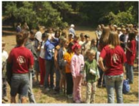
Lake and Mendocino Counties

policy states that “Protecting faculty, staff, students, visitors, the public and the environment is a priority whenever activities are planned and performed. The policy also establishes a strategy whereby damage is preempted by designing activities and controls to reduce or eliminate accidents, injuries, and exposures. Accordingly, this guidebook has been developed to assist in meeting the goals of the UC Policy on Management of Health, Safety and the Environment.