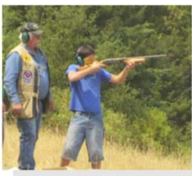
Lake and Mendocino Counties