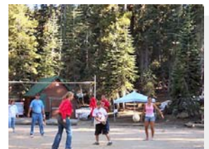
San Joaquin County

Teams preferably should be composed of members of similar size, skill level, and physical and emotional maturity.