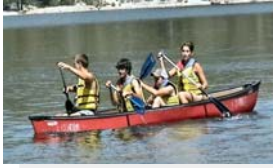
San Joaquin County

that 4-H employees, adult volunteers, and teen counselors also wear PFDs before boarding water craft.