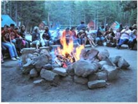
San Joaquin County

Never leave a campfire unattended and always put a campfire out by drowning it with water.