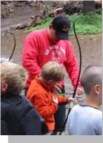
San Joaquin County

dropped arrow or other equipment until these signals have been given.