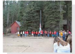
San Joaquin County

The University of California 4-H Youth Development Program (YDP), through its county UC Cooperative Extension (UCCE) offices, organizes and coordinates about 40 camps for more than 4,000 youth participants each year. Most of the camps are scheduled during the summer with a few taking place in the winter. Several camps are dedicated horse-riding camps. Regardless of the 4-H camp purpose or timing, camp programs, projects, and events incorporate activities that inherently have the potential for a variety of injuries or disease exposures to both 4-H camp volunteers and members. Information given in this guidebook has been developed for use by 4-H Representatives and Advisors, adult volunteers, and teen counselors and is intended to provide guidance for implementing practices and procedures to reduce the potential for sustaining injuries or illnesses while participating in 4-H sponsored camps.