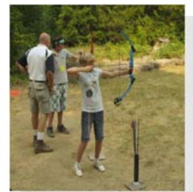
Lake and Mendocino Counties

Always stay behind the archery shooting line until instructed.