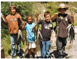
San Joaquin County

Look behind and to your sides before casting a lure or hook.