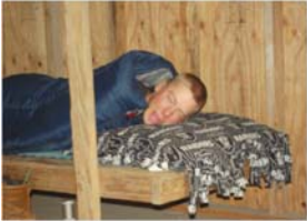
Lake and Mendocino Counties

Adult volunteers and counselors shall follow two deep and same gender 4-H YDP policies in sleeping areas of the camp.