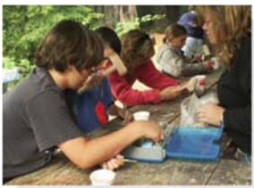
Lake and Mendocino Counties

Only use knives for their intended cutting/carving purpose.