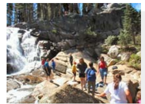
San Joaquin County

Never wander from your group or partner when hiking.