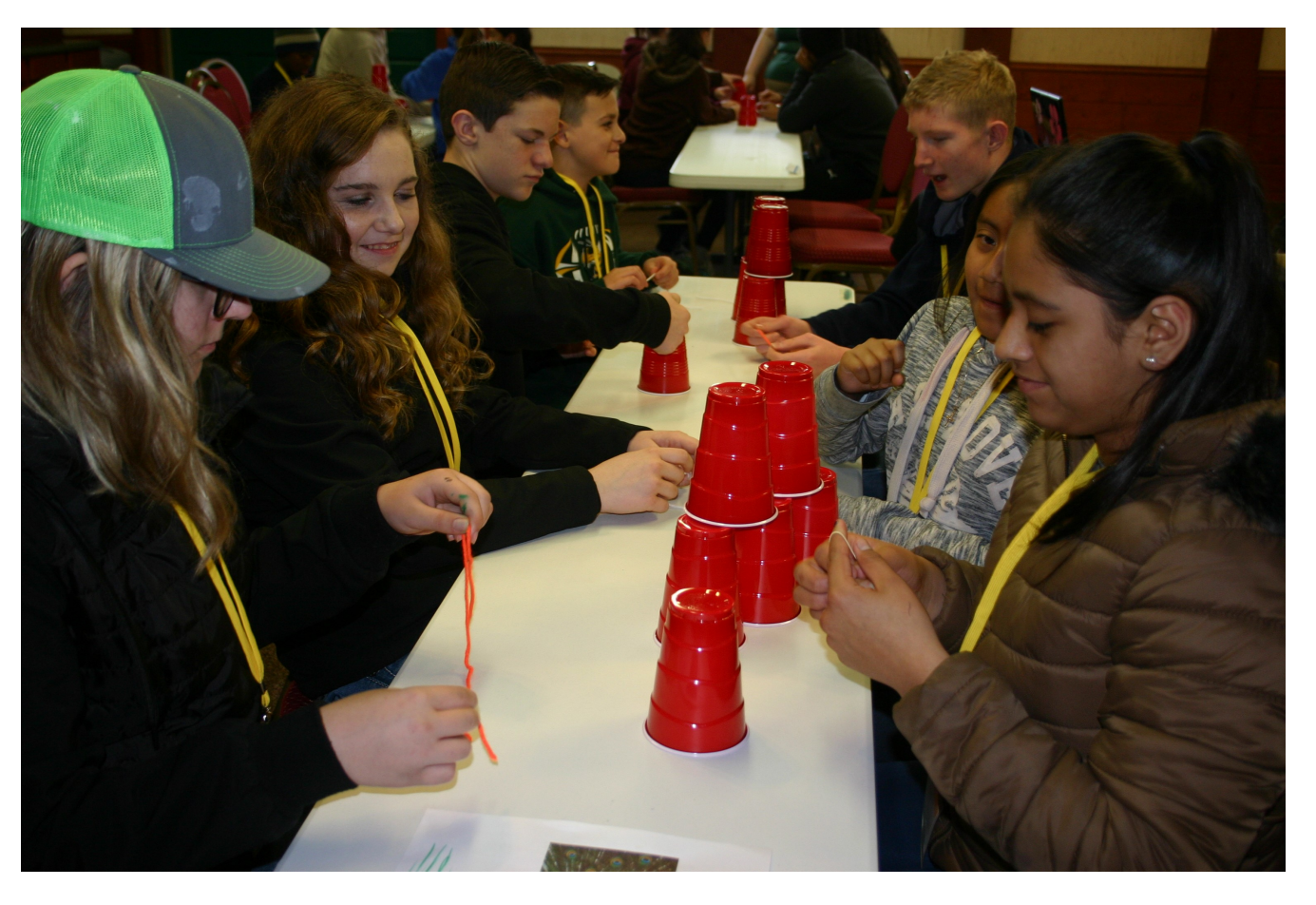
4-H Members from Santa Barbara County attended the 2019 Youth Leadership Summit