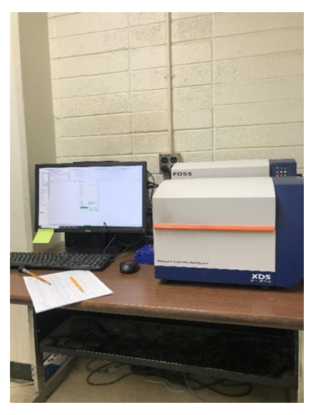
The FOSS NIRS scanning machine at the Forage and Range Research Lab, USDA ARS in Logan Utah, that predicts forage quality components.

I attended the annual cattlemen's meeting, and other board meetings, giving short presentations/updates on the ongoing forage production project and about new species of forage plants that are ready for testing on the Central Coast.