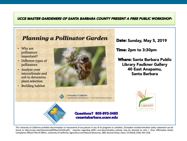
Upcoming: UC Master Gardener Pollinators Workshop on May 5

Our mission is to extend research knowledge and information to empower people to improve and enhance their We represent a unique partnership between the University of California, the County of Santa Barbara, and the United States Department of Agriculture.