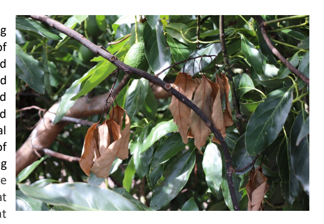
Typical symptoms of avocado branch canker demonstrating dieback of the shoot and leaves, progressing from the tip of the shoot toward the main branch or trunk.

Growers of agricultural crops throughout California face ever increasing challenges related to pest management through the introduction of invasive pest species, increased production costs, changing federal and state laws and regulations, and consumer preferences. Ecosystem-based strategies for agricultural pest management that are developed and validated through local field research and evaluation, disseminated through effective educational opportunities, and adopted on a regional or areawide scale are essential to maintaining economic viability of agricultural crops. Integrated pest management is a decision-making strategy that focuses on long-term prevention of pests or their damage through a combination of techniques such as biological control, habitat manipulation, modification of cultural practices, and use of resistant varieties. Pesticides are used only after monitoring indicates they are needed according to established guidelines, and treatments are made with the goal of removing only the target organism. Pest control materials are selected and applied in a manner that minimizes risks to human health, beneficial and nontarget organisms, and the environment.