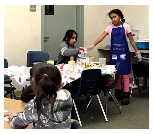
4-H SNAC Students teaching a 2nd grade class how to make a healthy oatmeal breakfast.

Lastly, UC CalFresh continued to support 80 teachers and 3800 • students with comprehensive nutrition education service at five school sites in the Santa Maria-Bonita School District and one school site in Lompoc. The teachers received No-Prep Nutrition Education curriculum kits. Students in grades Kindergarten through 6th participated in cooking demonstrations led by UC Community Education Specialist and SNAC youth leaders during this quarter.