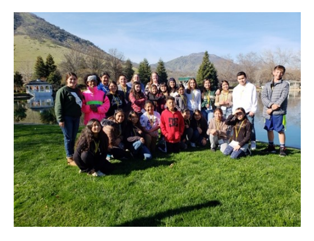
Sixteen youth from five 4-H Clubs attended the 2019 Central 4-H Youth Summit

The University of California 4-H Youth Development Program provides training and resources to local volunteers who partner with youth to bring about positive change in our communities. The 4-H program equips youth with hands-on science activities, healthy living knowledge, leadership experiences, and service-learning opportunities. Participation in 4-H prepares youth to understand and acquire the skills that will allow them to become problem-solvers and astute leaders.