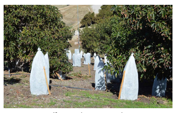
Young Coffee Plants Under Wraps Protected from Frost in an Avocado Orchard