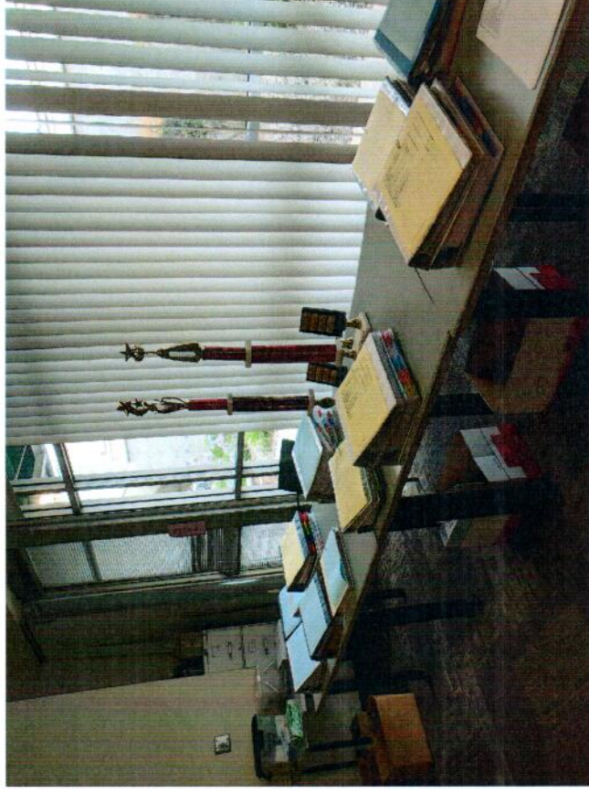
Welcome Table and Table Set-up with County Books