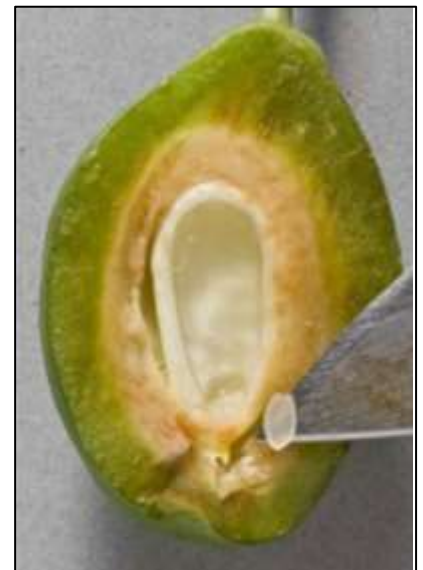
Figure 1. Extraction of the endosperm on a developing prune.

This year, processors desire large A screen fruit. To keep your crop from falling through the sizer, you need to do some legwork, estimate your fruit set, and thin if needed. Thinning should occur roughly around the same time as 'reference date', or the point at which 80 to 90% of the fruit have a visible endosperm. The endosperm, a clear gel-like glob, will be found in the seed on the blossom end of the prune (Figure 1) and is solid enough to be removed with a knife point. Typically, the reference date occurs in late April or early May, approximately one week after the pit tip begins to harden. The earlier thinning is done, the greater effect it will have on final fruit size at harvest. However, if you thin too early, you may damage the trees without removing the desired number of fruit.