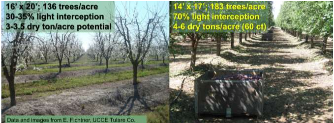
Figure 3. Two orchards with contrasting spacing, light interception and yield potential.