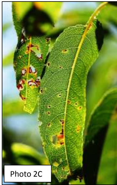
Photo 2. (A) Necrotic lesions inside almond hull caused by bacterial spot infection. (B) Bacterial spot gumming on almond hulls. (C) Necrotic bacterial spot foliar symptoms.