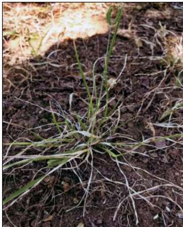
Figure 2. Threespike goosegrass 3 weeks after a 2 qt/A Roundup Weathermax treatment. Plant exhibits regrowth and ability to flower.