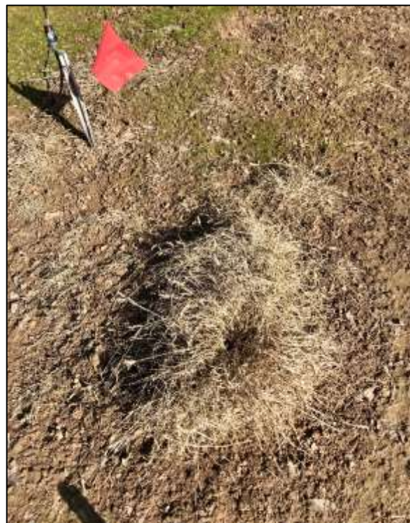
Figure 3. Heavily tillered threespike goosegrass 5 weeks after Fusilade treatment. Full necrosis achieved.