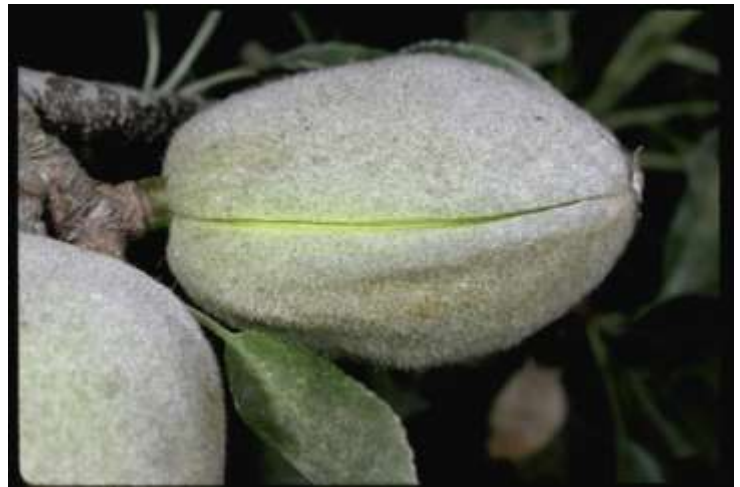
Target stage (b2 stage of early hull split) for first NOW and hull rot ( Rhizopus ) spray.

Hull split is a critical timing for pest control in almonds. NOW and hull rot pressure have increased the last few years. Proper spray timing and delivery will help make reject sheet reading less painful and almond growing more profitable.