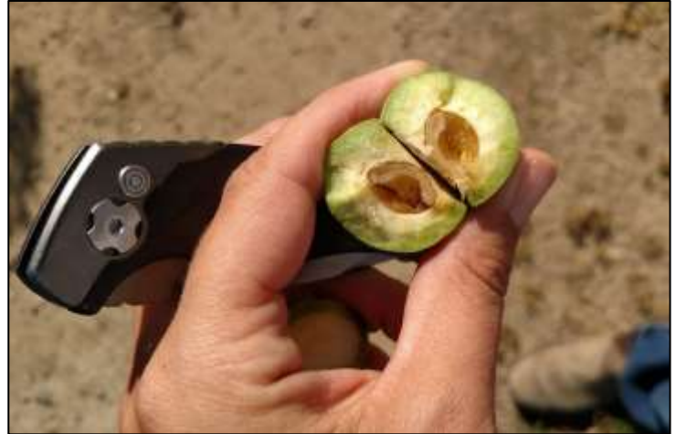
Photo 5. Boron deficiency causes gummy almond kernels.