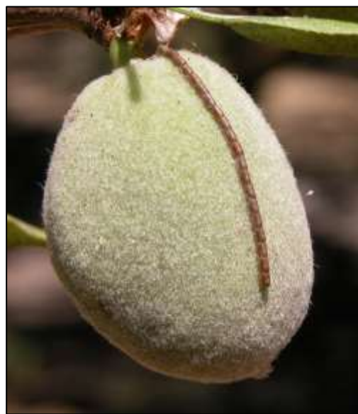
Photo 3. Leaf-footed bug egg mass on almond.