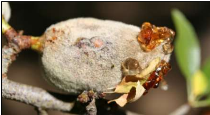
Photo 1. Anthracnose lesions and gumming on almond hull.

More detail on identification and management of the potential causes of hull gummosis, shell, and kernel gumming can be found in the UC Statewide IPM Programs Pest management Guidelines for Almonds ( ipm.ucanr.edu/PMG/selectnewpest.almonds.html ), and in multiple posts at the Sacramento Valley Orchard Source Website ( http://www.sacvalleyorcards.com/ ) and the Almond Doctor Blog ( thealmonddoctor.com/ ).