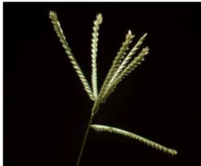
Figure 1. Digitate inflorescence – or spike – comparison. Threespike goosegrass ( E. tristachya ) on the left, goosegrass ( E. indica ) on the right.