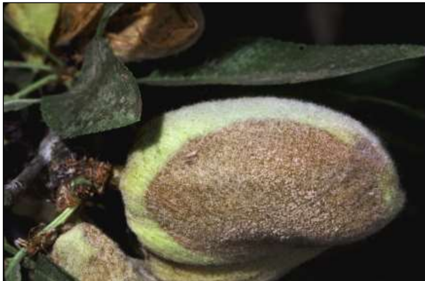
Figure 1. Hull rot caused by Monilinia causes a tan lesion on the outside of the hull. This symptom is hard to see once hulls dry.