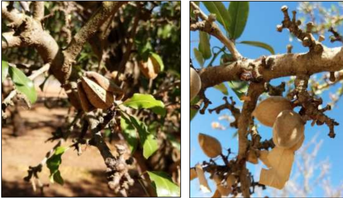
Figure 4. Symptoms of hull rot caused by Phomopsis differ by cultivar. These photos, from the same orchard, show fully split nuts on cv. Mission (left), and unsplit nuts on cv. Butte (right). Sticktightns from both trees tested positive for Phomopsis .