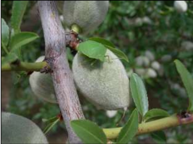
Photo 4. Adult green stink bug on almond.